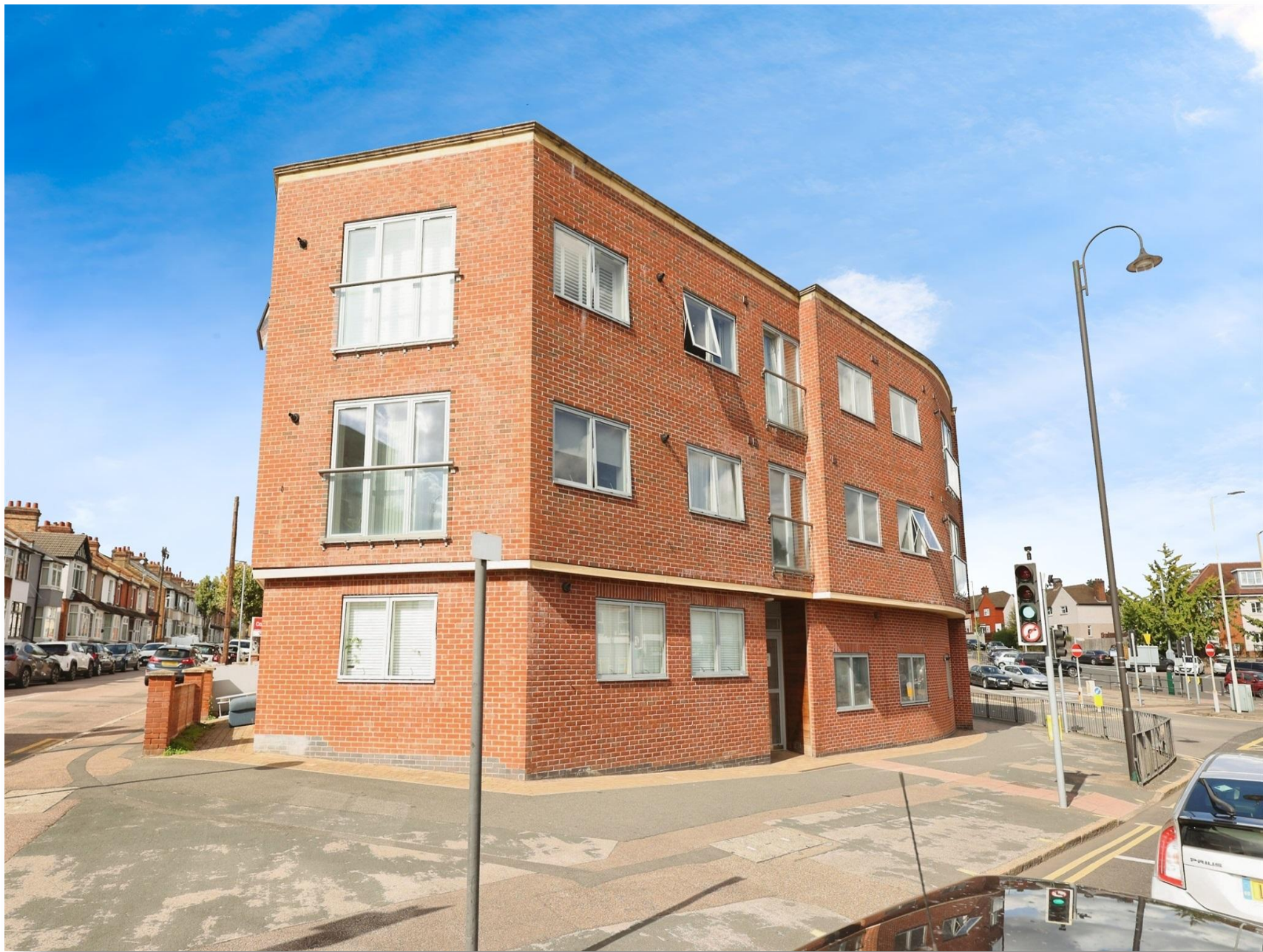
Verulam Court, St. Albans Road, Watford, WD24 5BJ