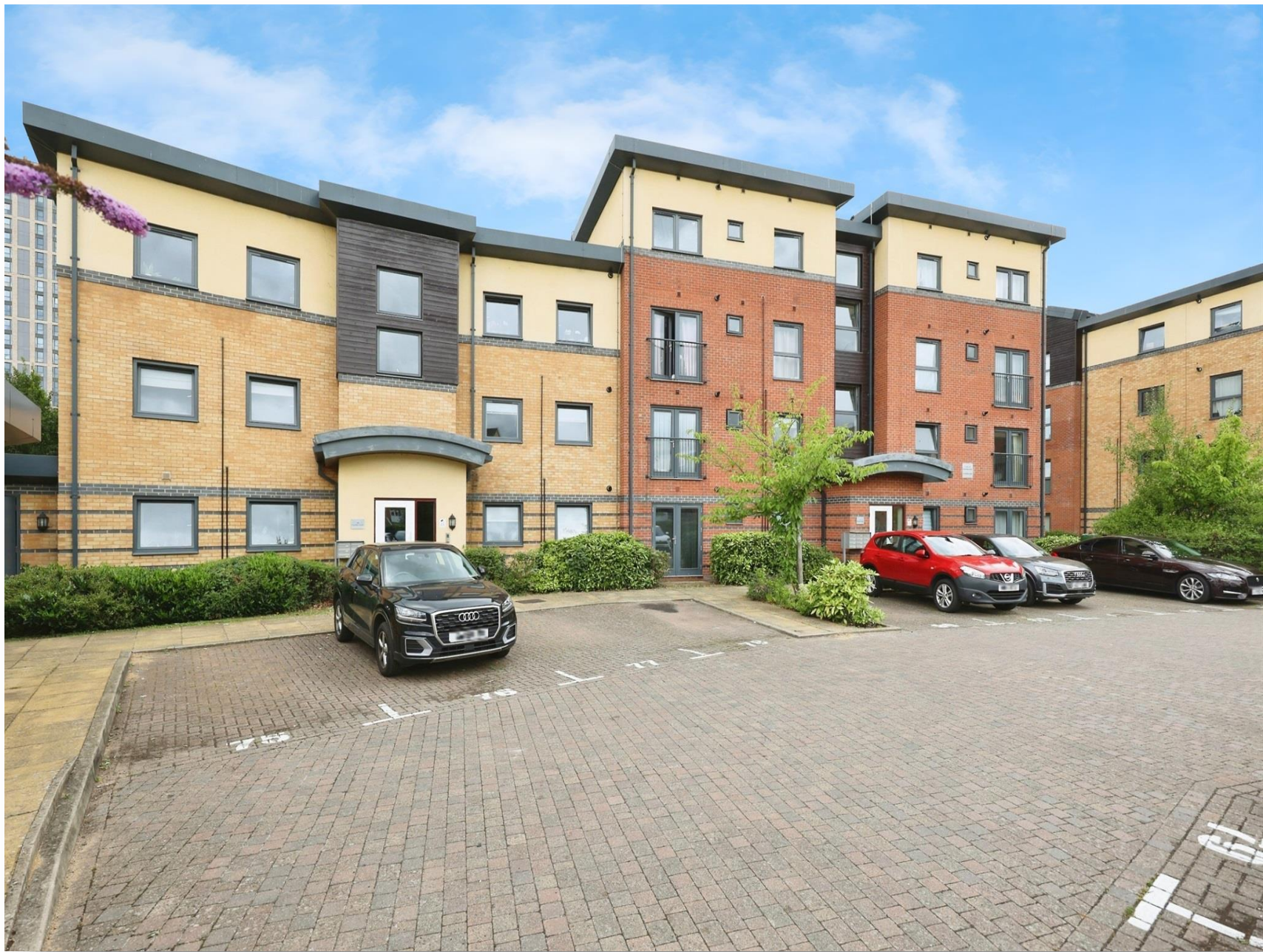
Fountain Court, Raven Close, Watford, WD18 7DG