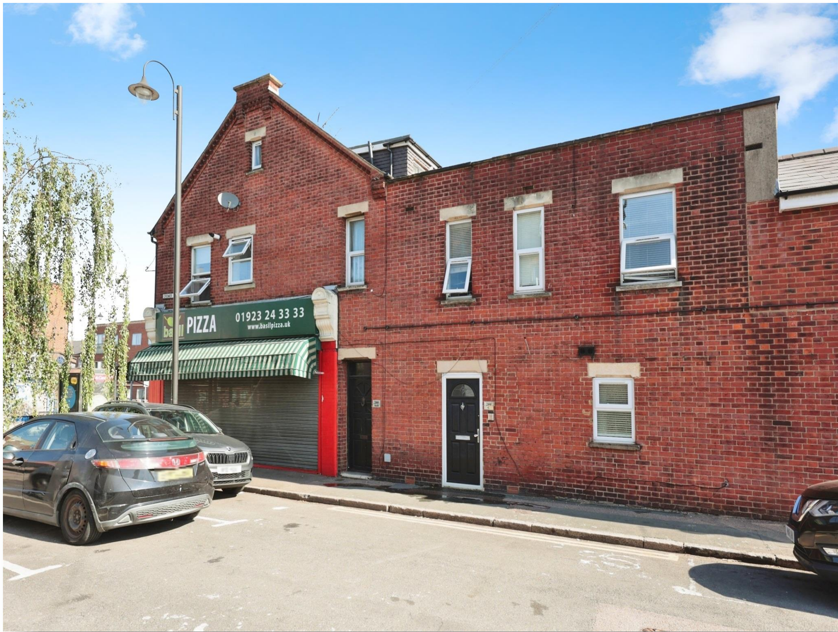
St. Albans Road, Watford, WD24 4AX