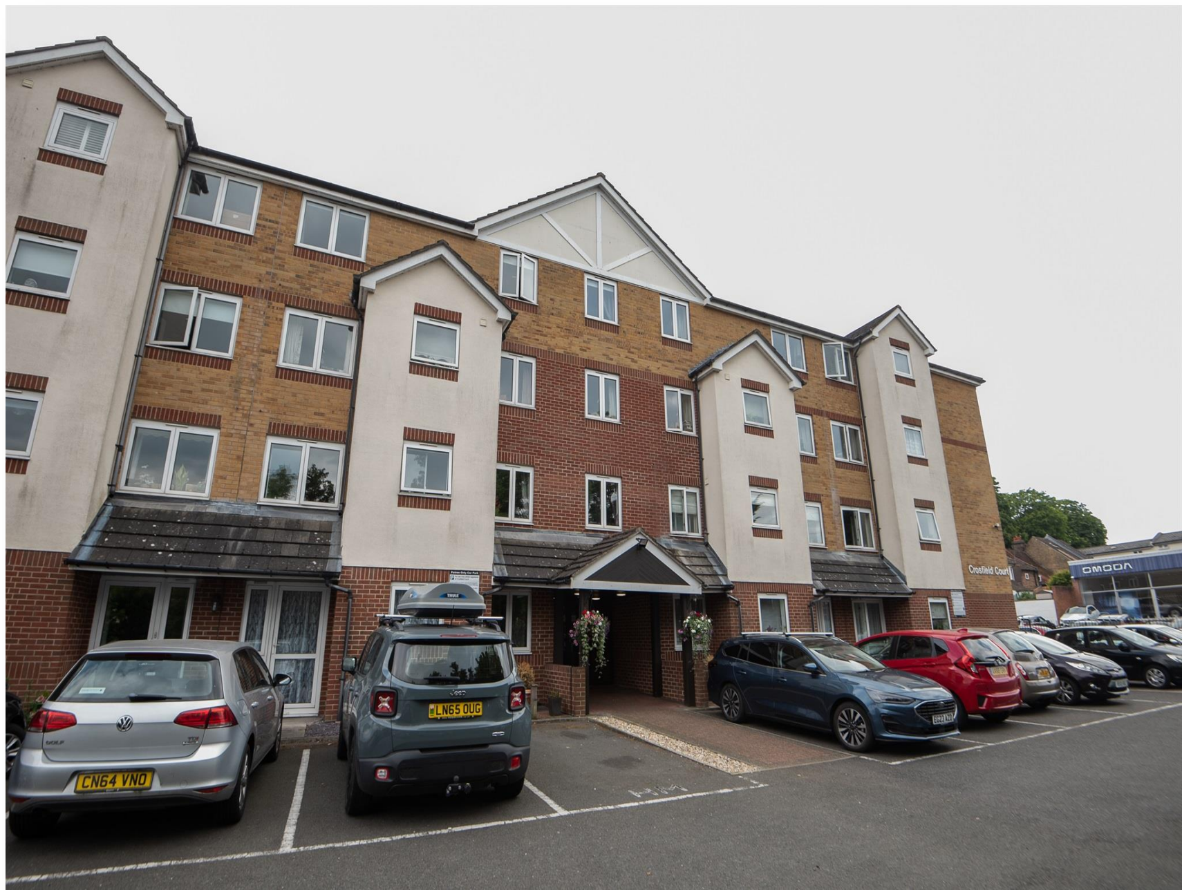
Crosfield Court, Lower High Street, Watford, WD17 2DB