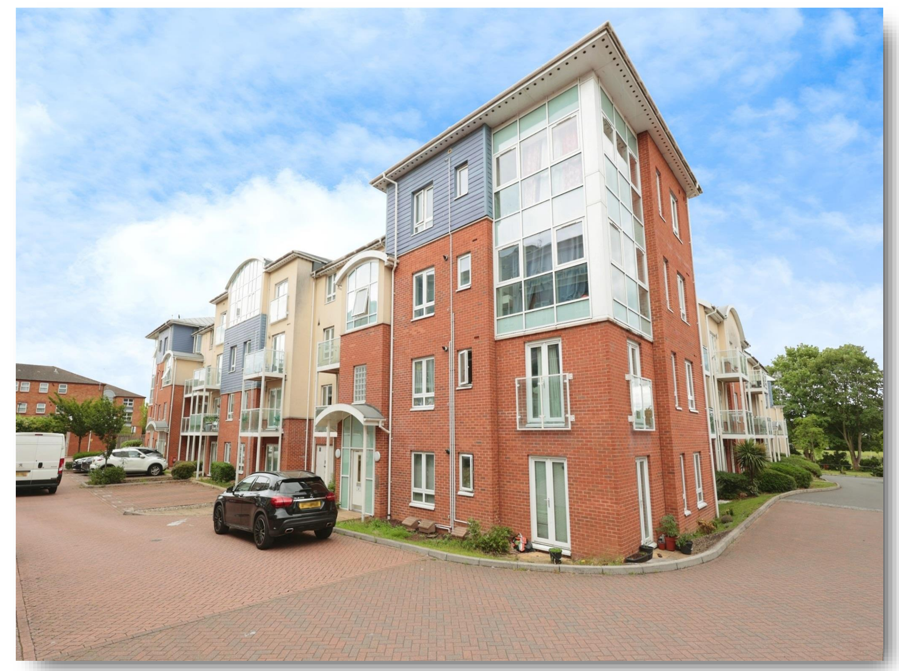
Wells Court, Pumphouse Crescent, Watford, WD17 2AA