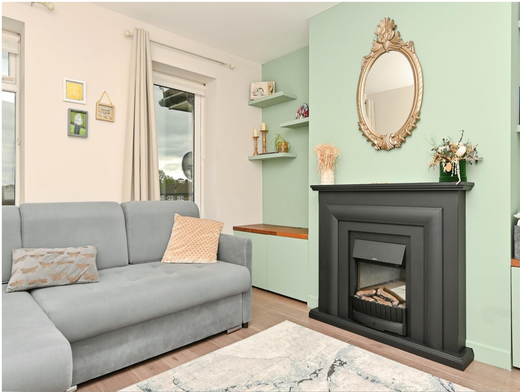
Lemsford Court, Borehamwood, WD6 2LG