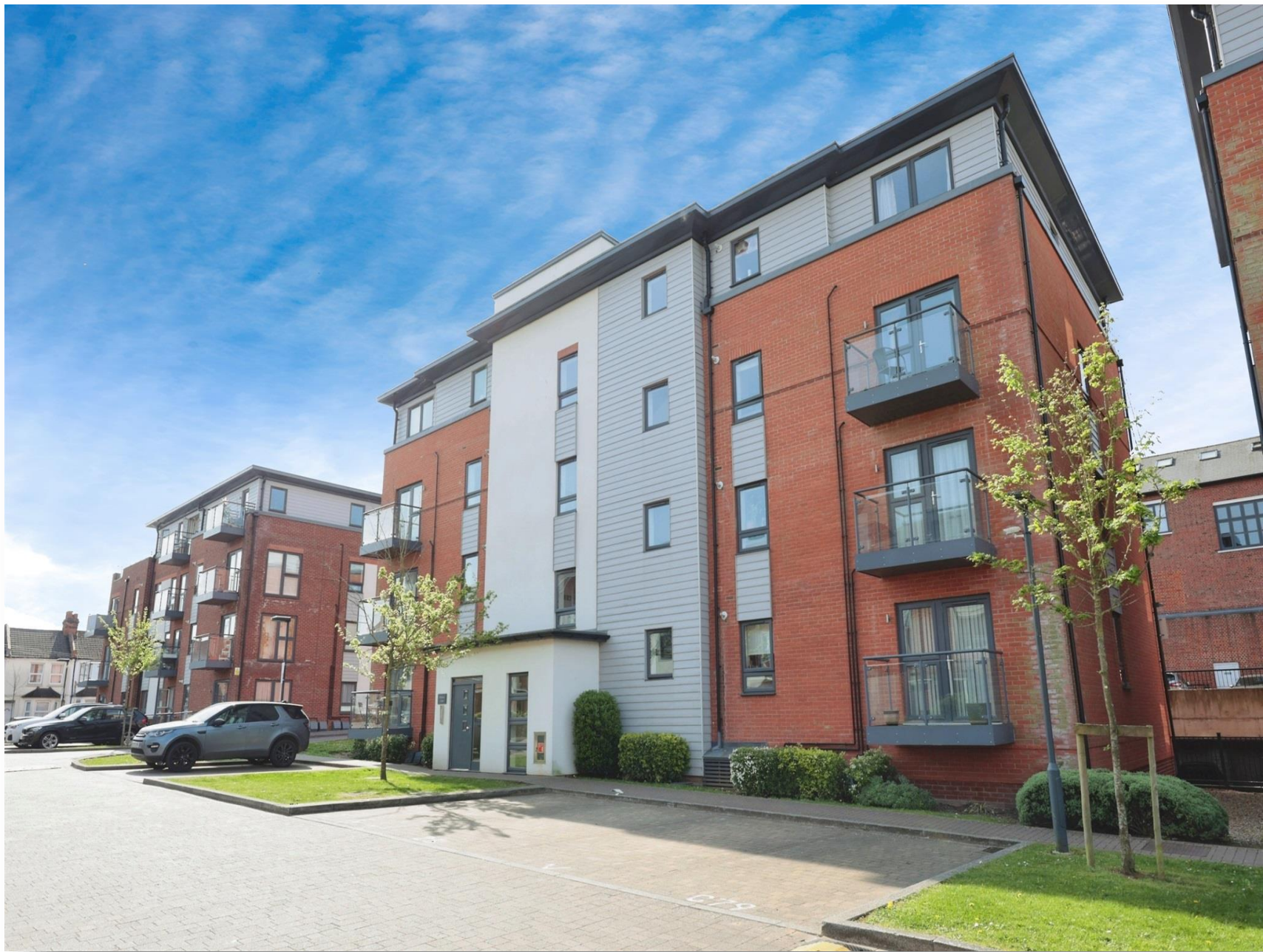
Weldon Court, Rembrandt Way, Watford, WD18 7DP