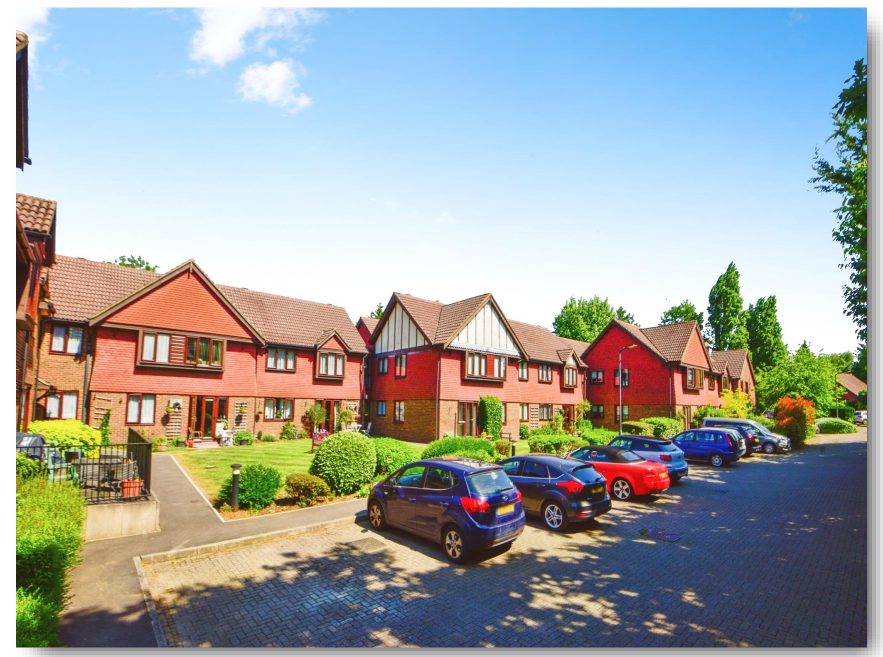
The Gables, Ransom Close, Watford, WD19 4NG