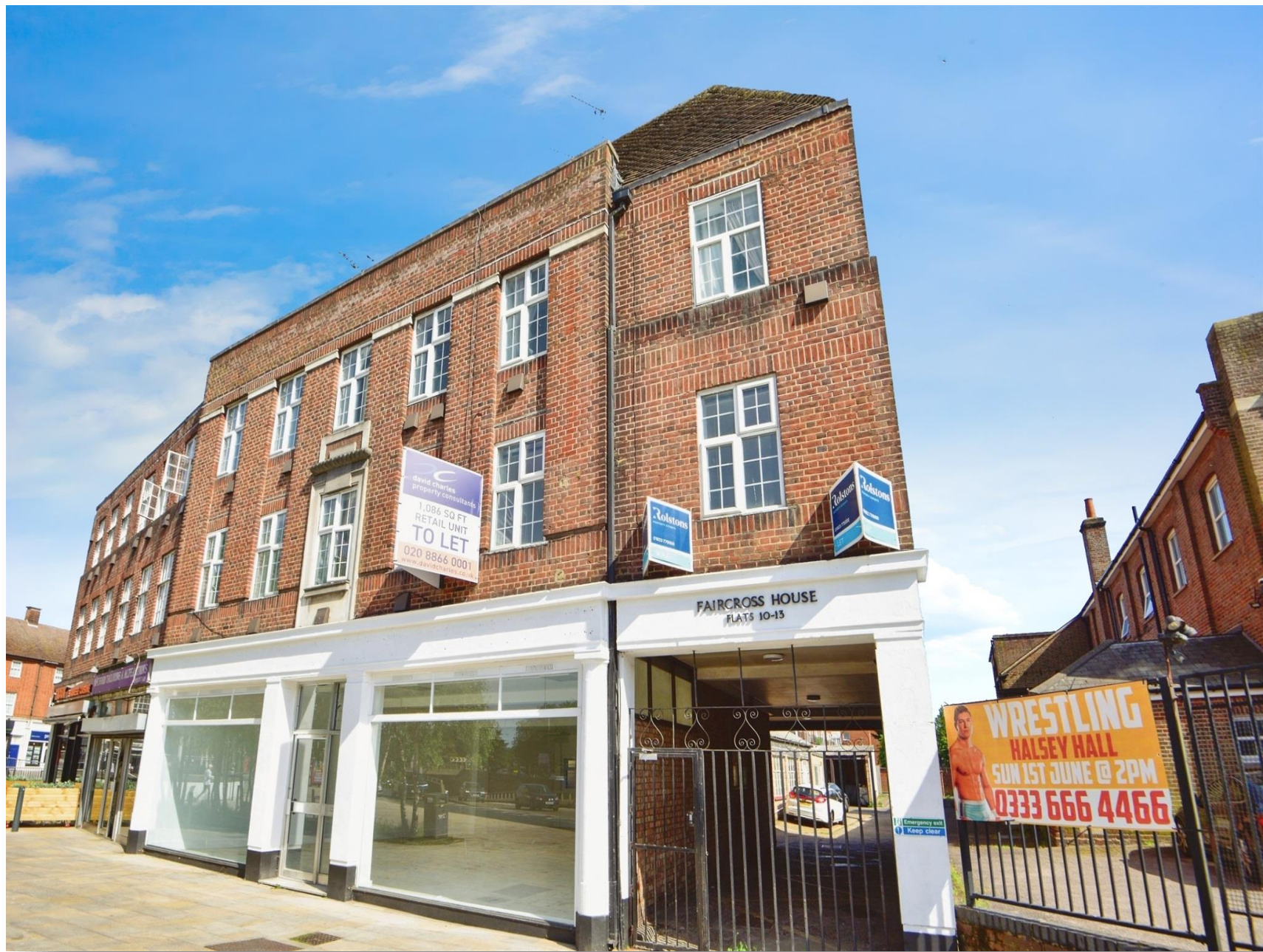
Faircross House, The Parade, Watford, WD17 1BA