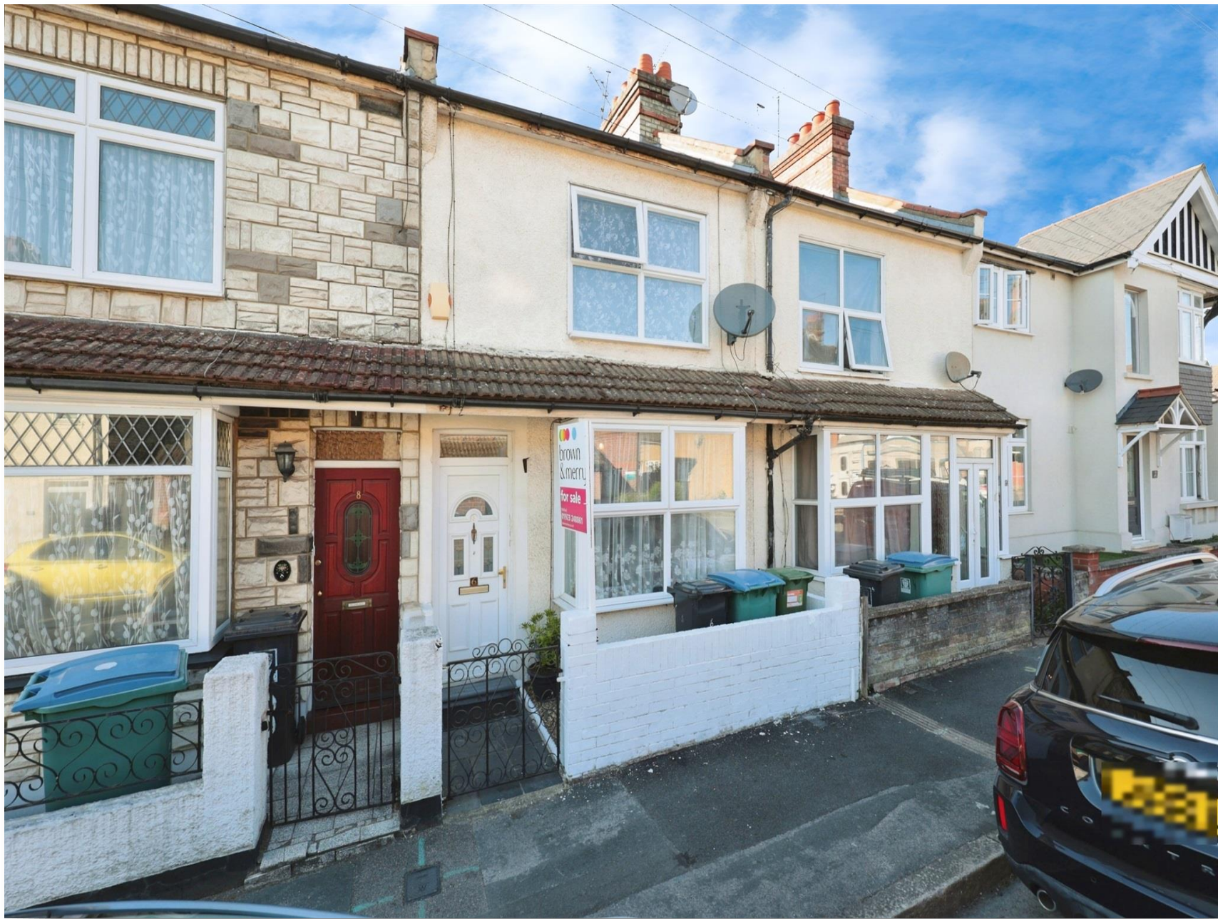
Benskin Road, Watford, WD18 0HW