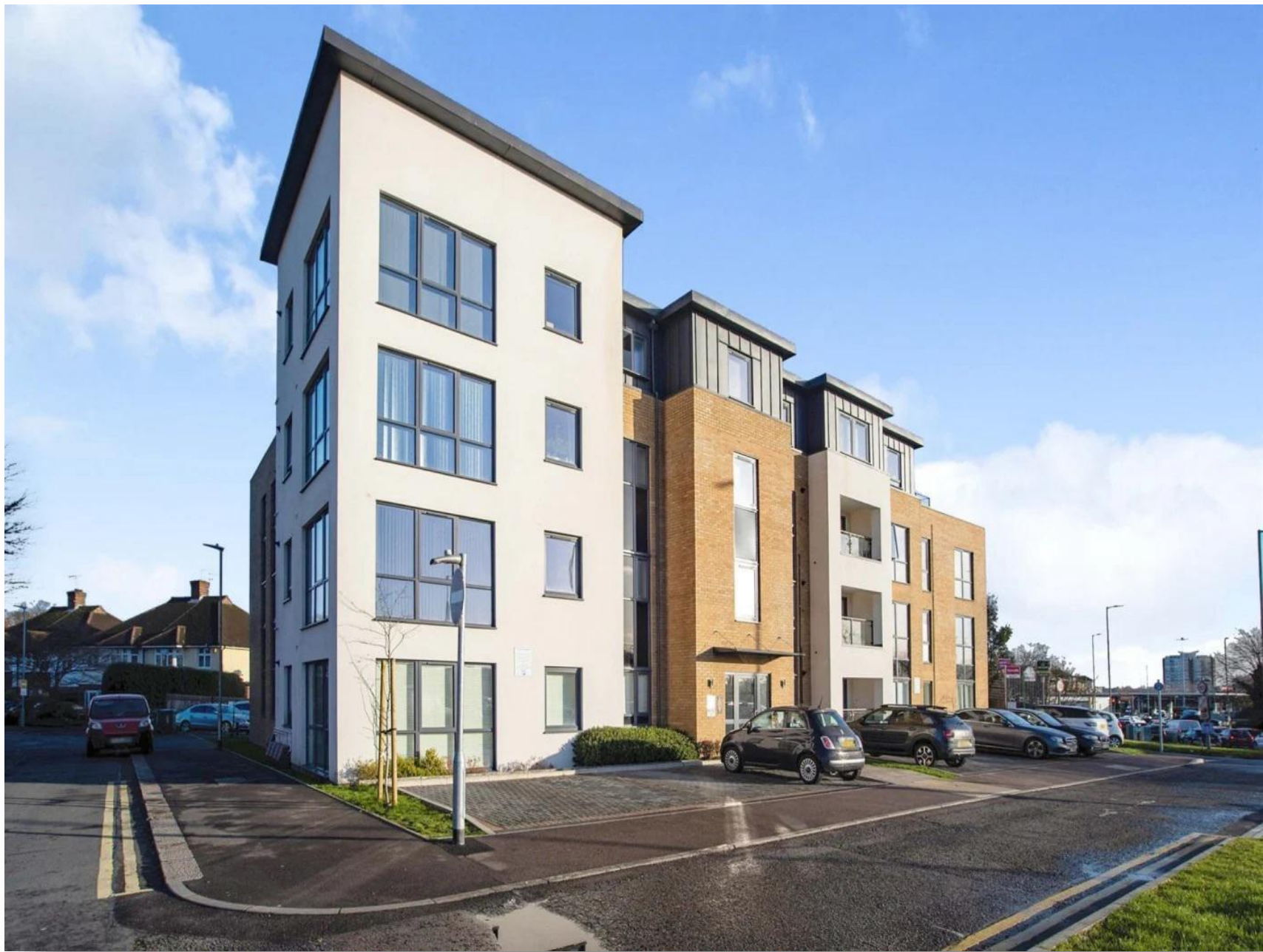
Dome Mews, St. Albans Road, Watford, WD25 9JH