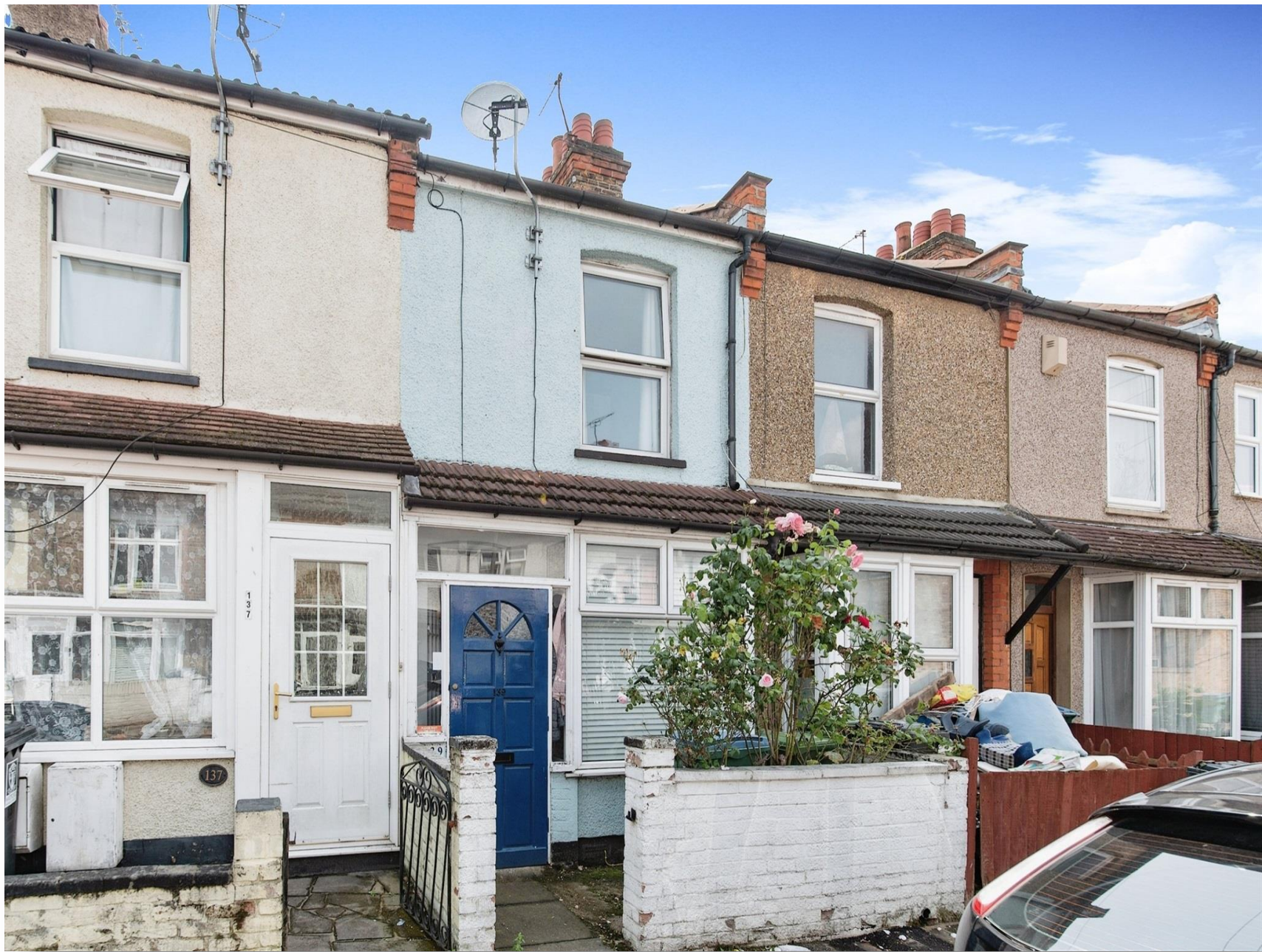
Chester Road, Watford, WD18 0RE