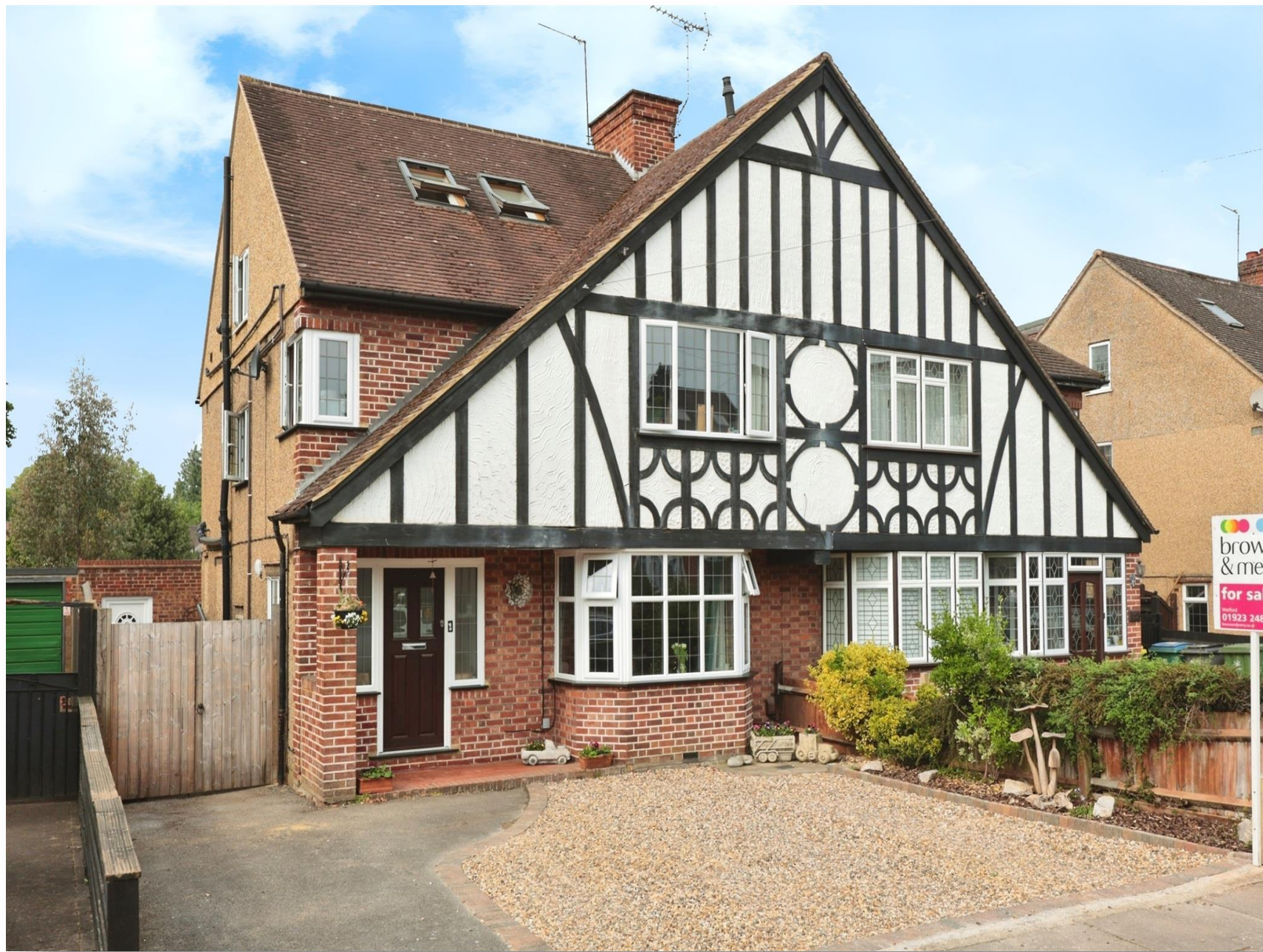
Orchard Drive, Watford, WD17 3DX