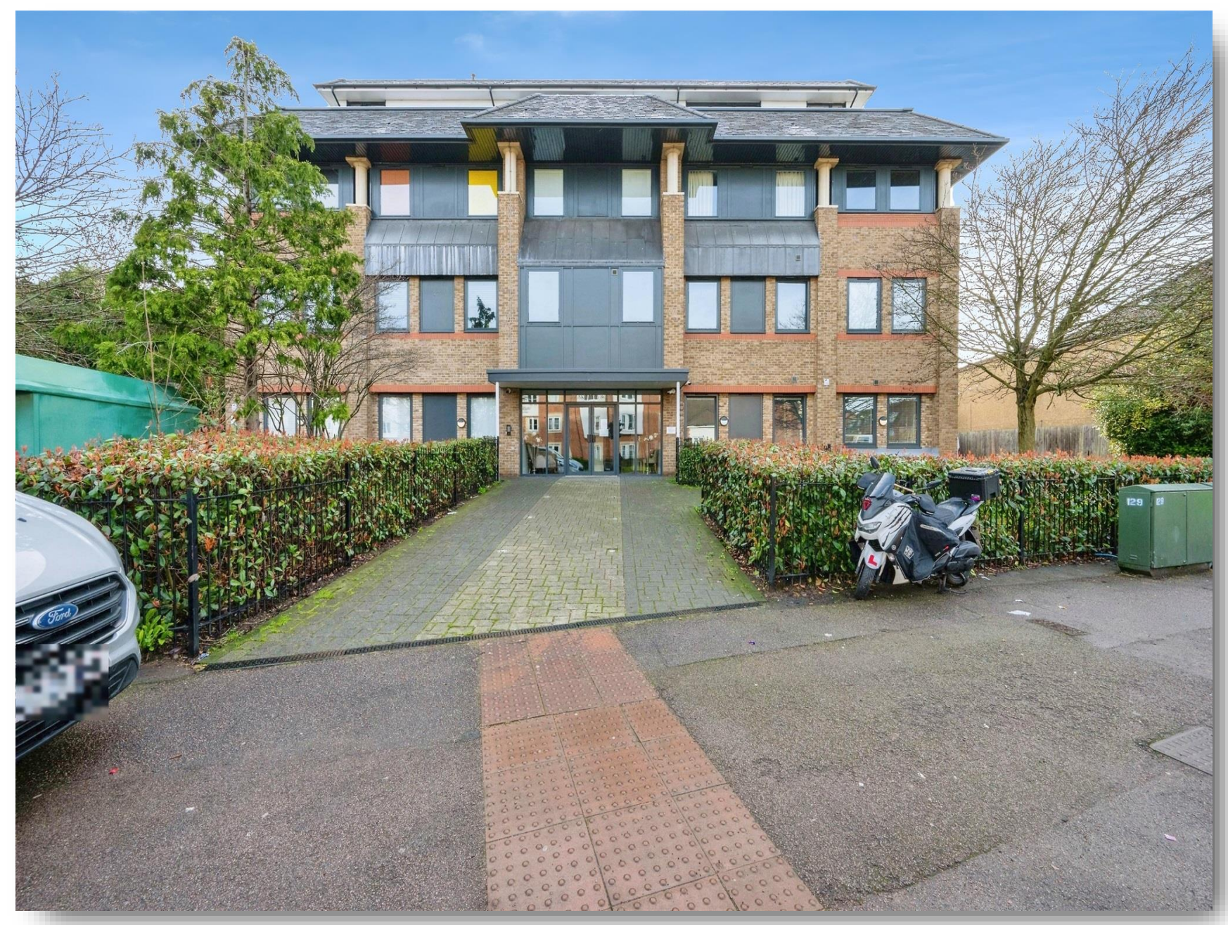
Aldenham Road, Bushey, WD23 2FU