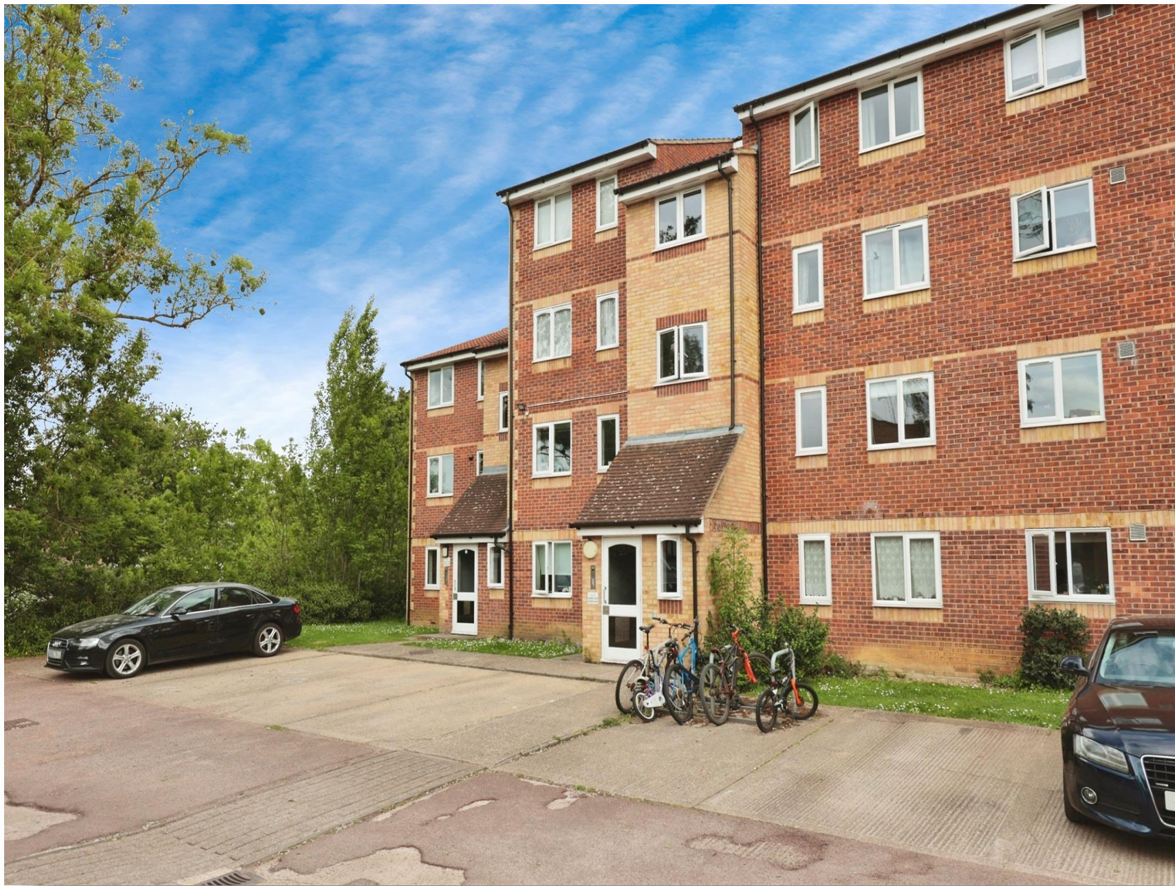
Guernsey House, Pioneer Way, Watford, WD18 6ST