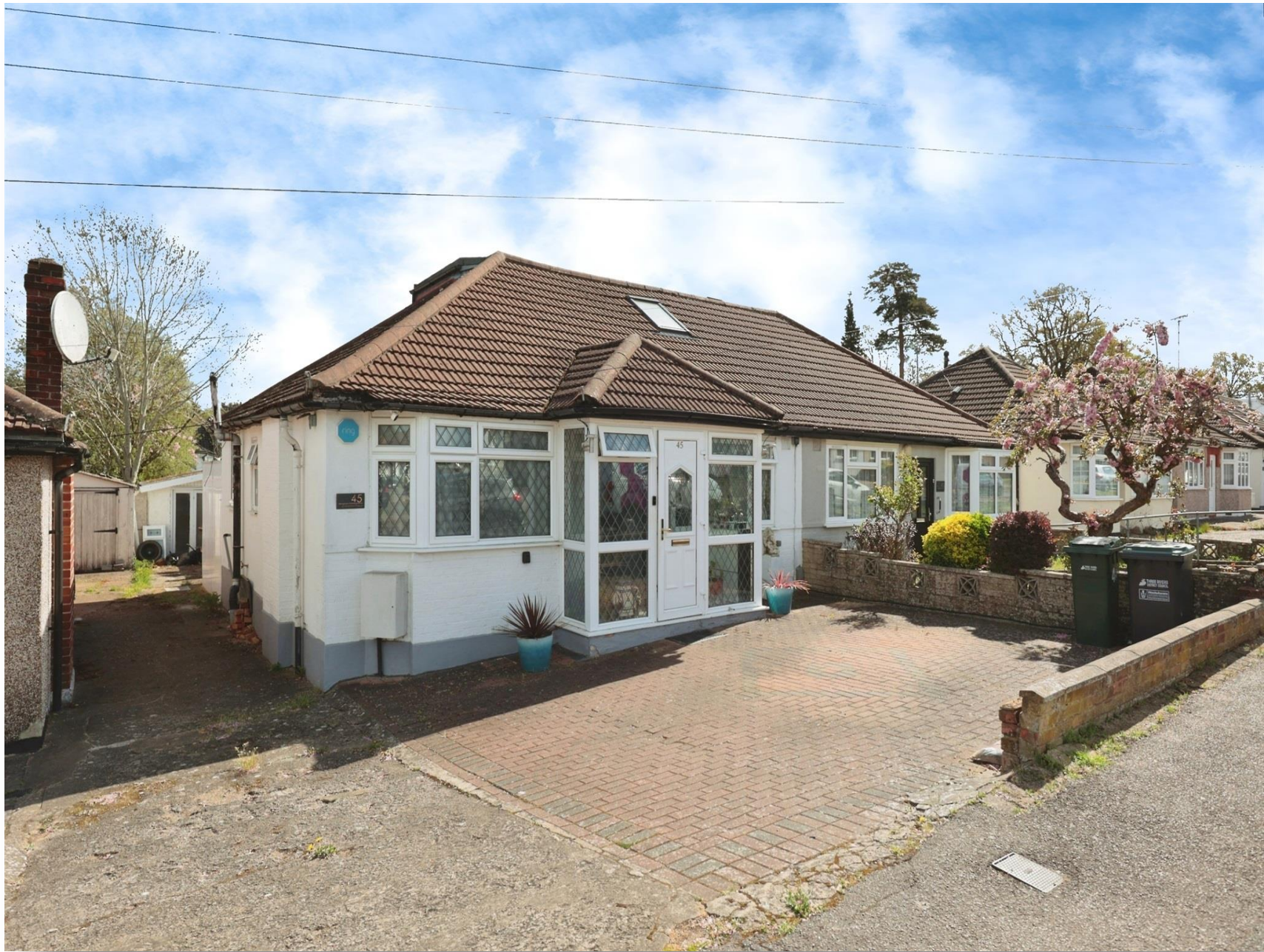
Compton Place, Watford, WD19 5HF