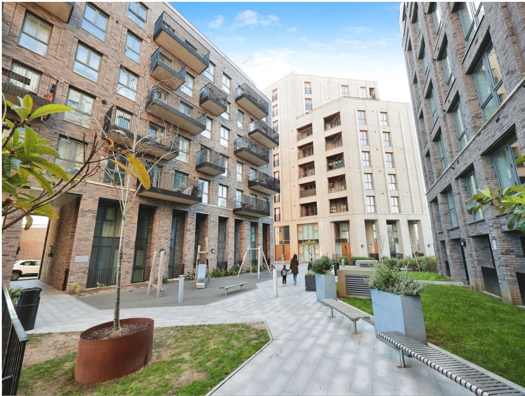
Conway Court, Marri Street, Watford, WD24 5GA