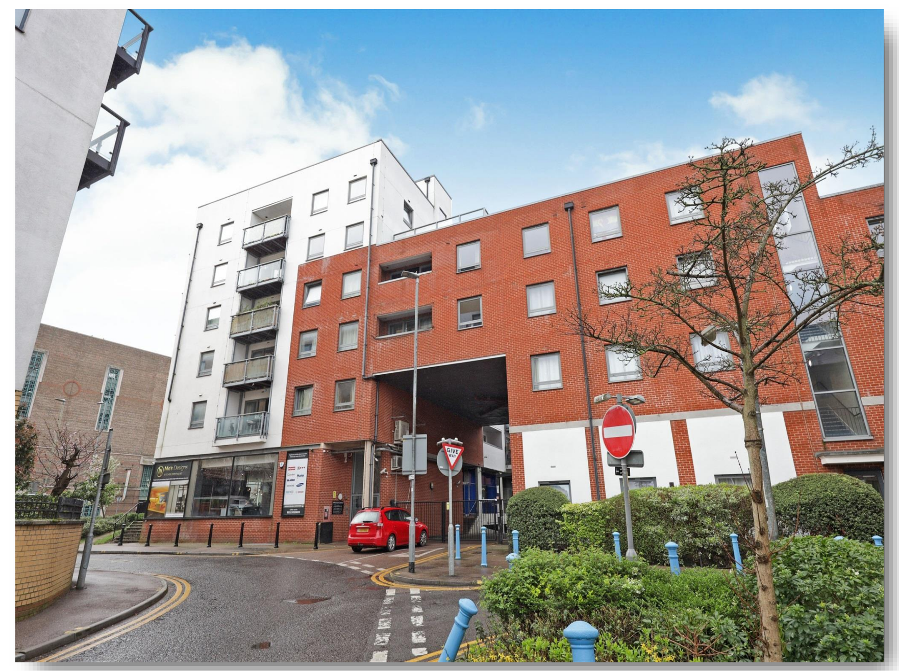
Ashleigh Court, Loates Lane, Watford, WD17 2PJ