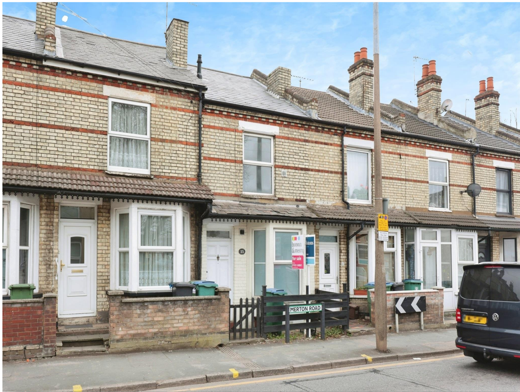
Merton Road, Watford, WD18 0WU