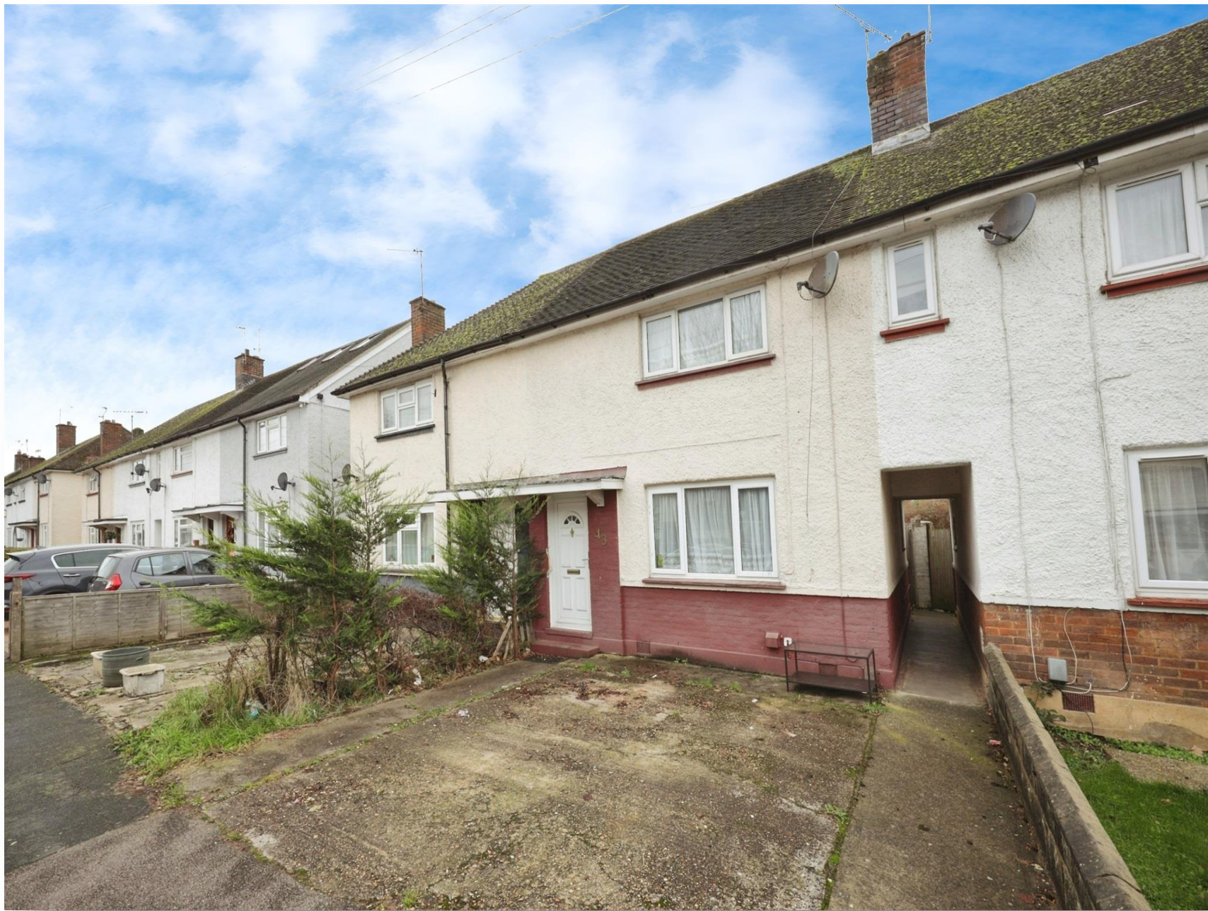
Rushton Avenue, Watford, WD25 0AP