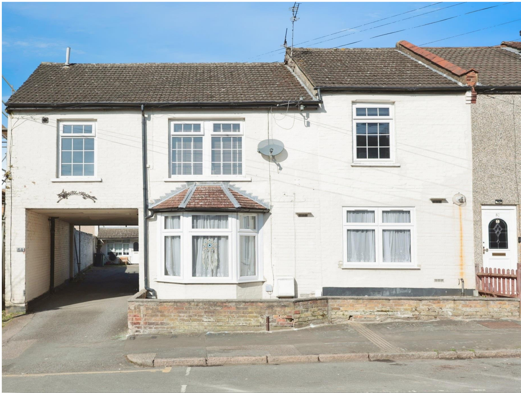
Dairy Mews, Holywell Road, Watford, WD18 0HF