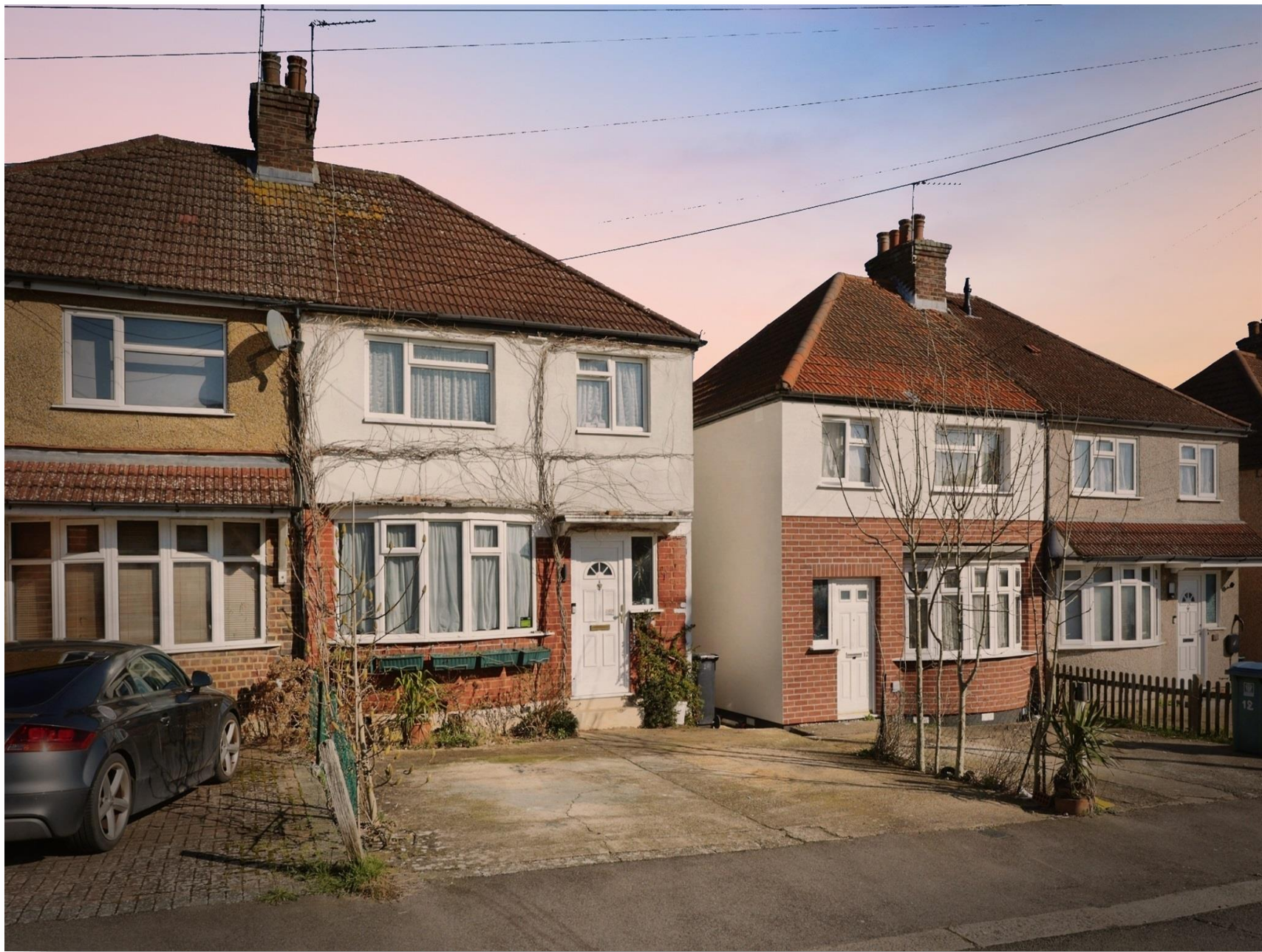
Oakdene Road, Watford, WD24 6RW