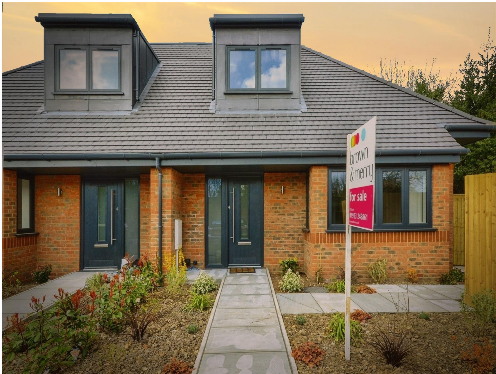
Redheath Close, Watford, WD25 7AH