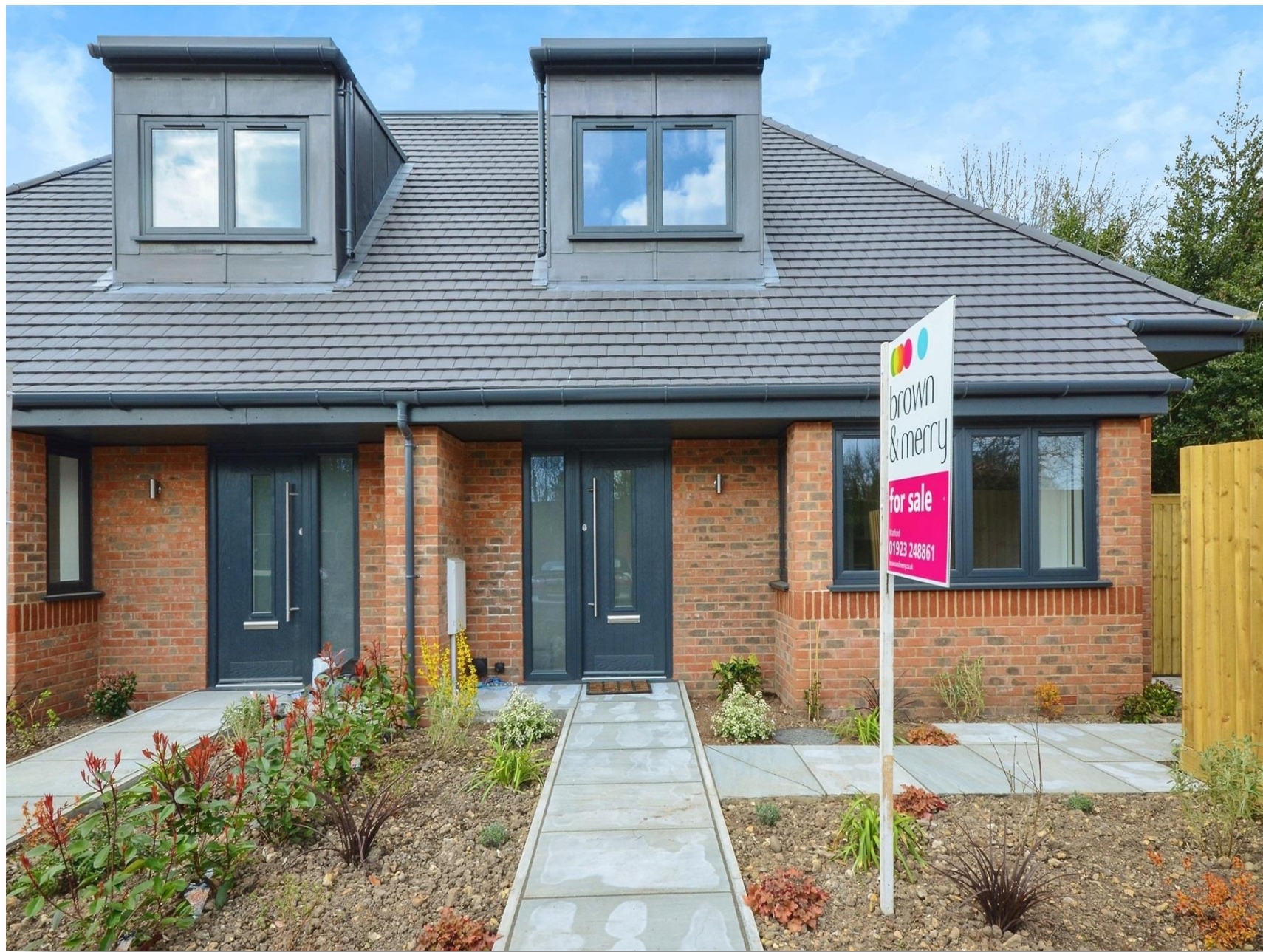
Redheath Close, Watford, WD25 7AH