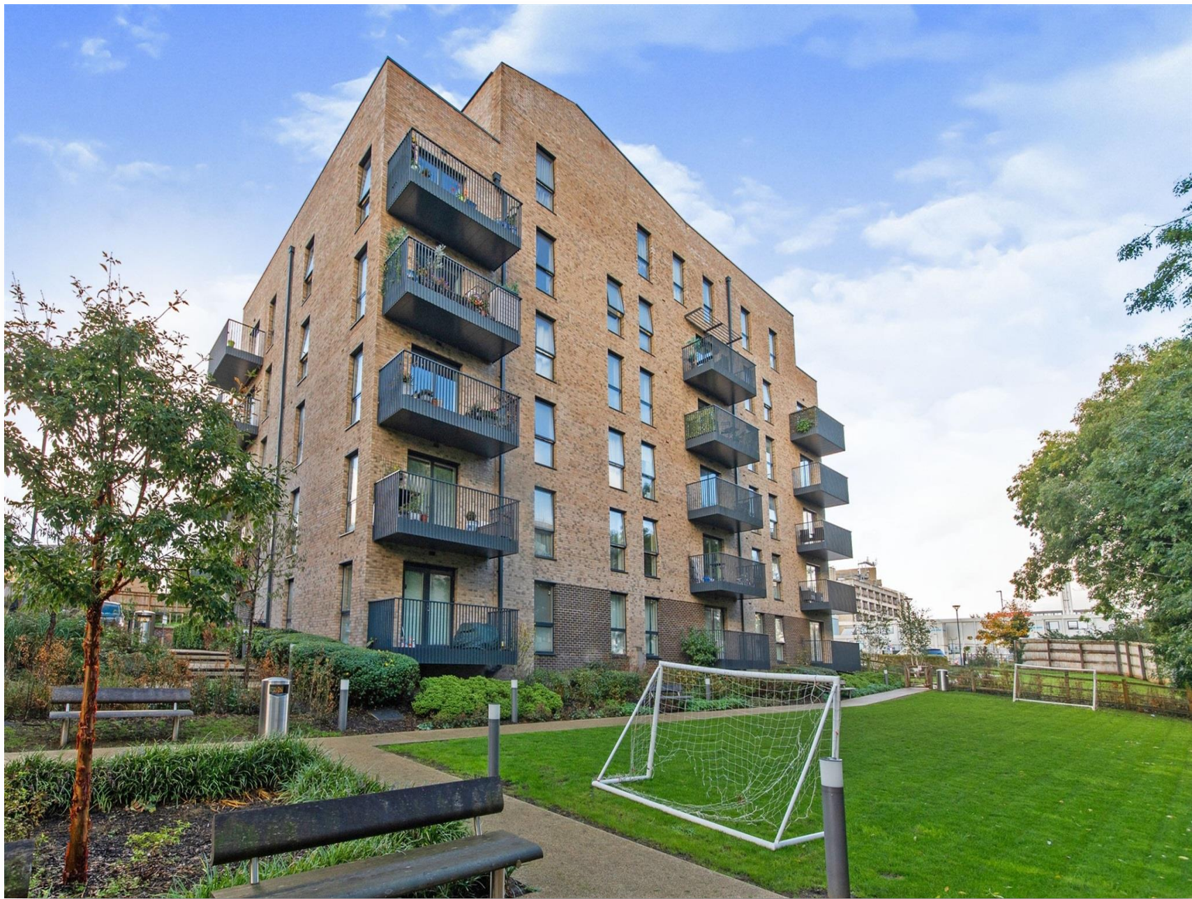
Maple Lodge, Riverwell Close, Watford, WD18 0GY