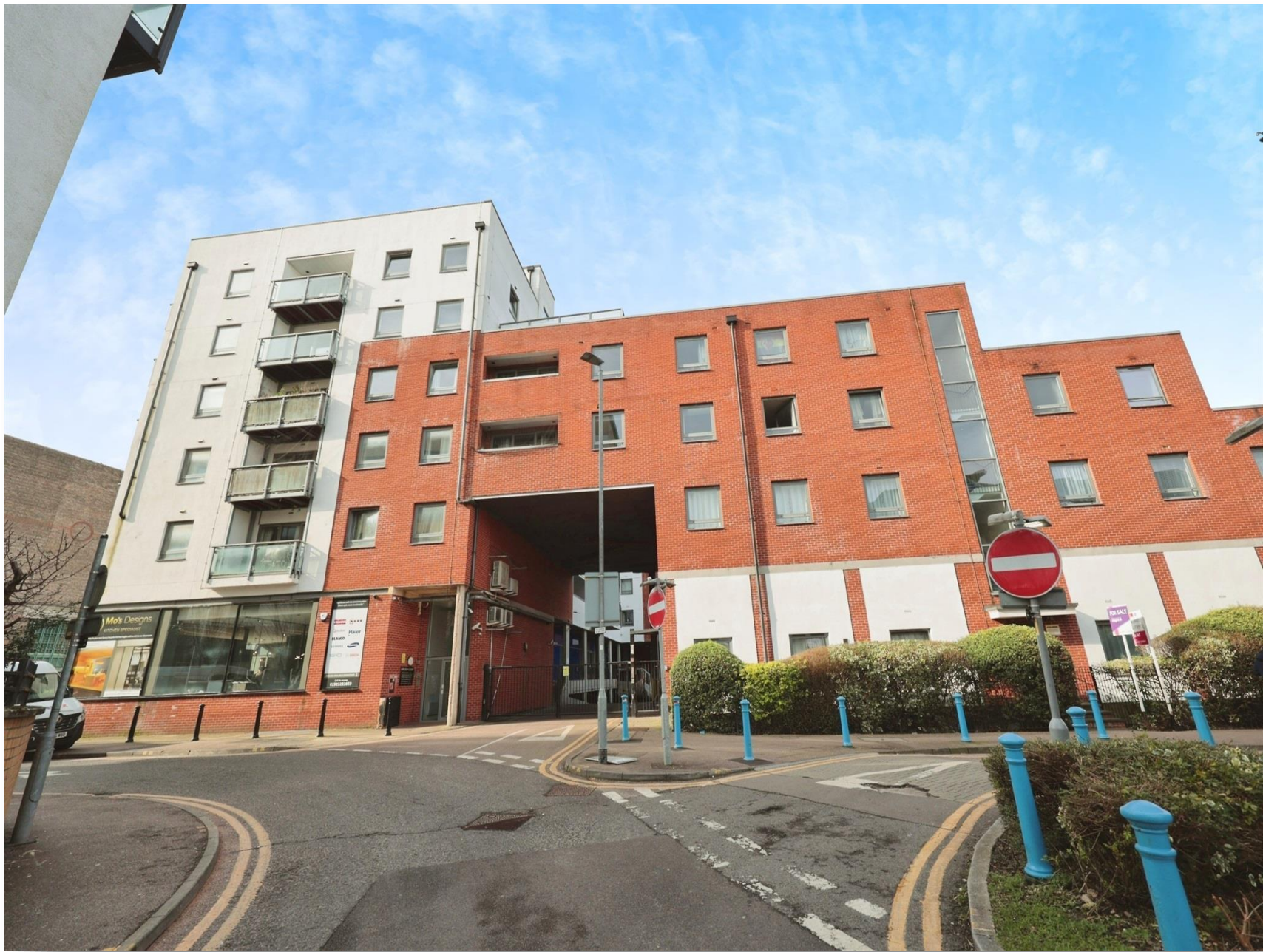
Ashleigh Court, Loates Lane, Watford, WD17 2PJ