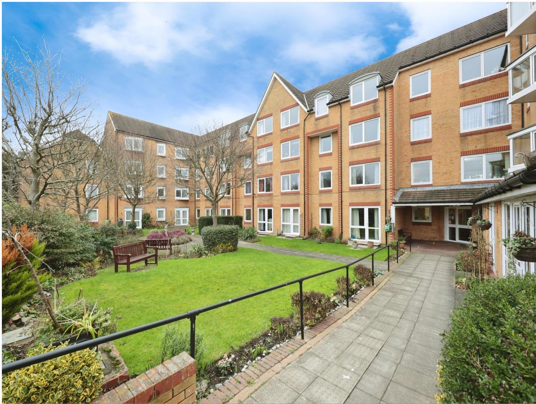
Homemanor House, Cassio Road, Watford, WD18 0QS