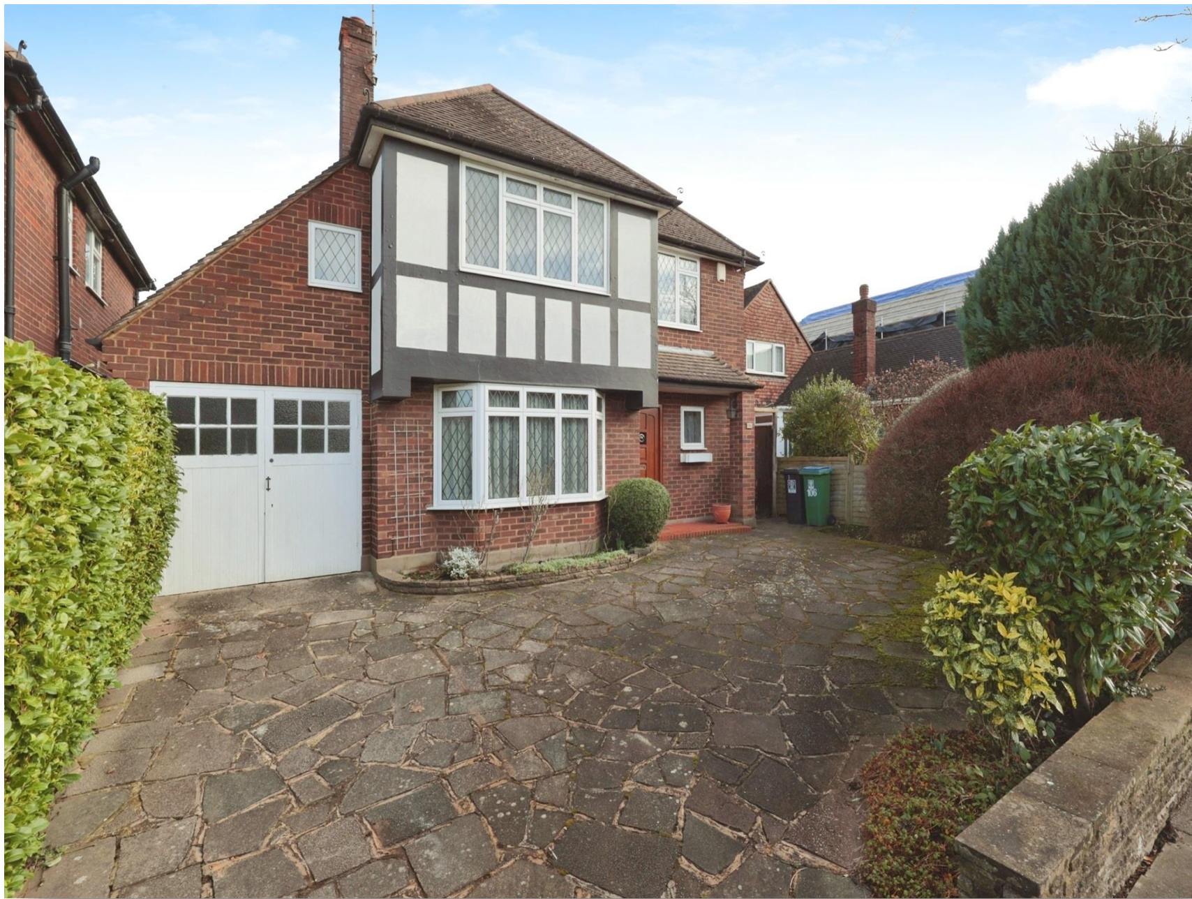
Woodland Drive, Watford, WD17 3LB