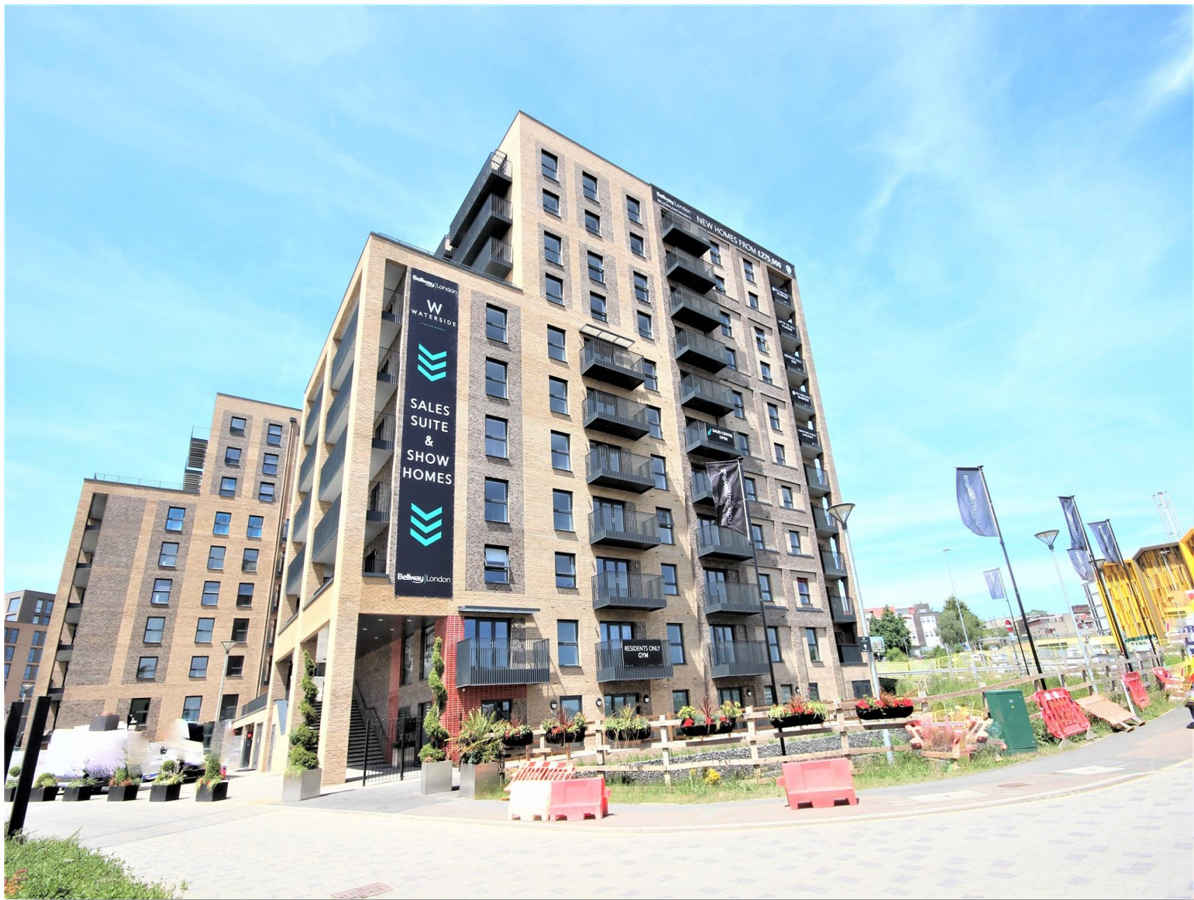
Springwell Apartments, Colnebank Drive, Watford, WD18 0LE