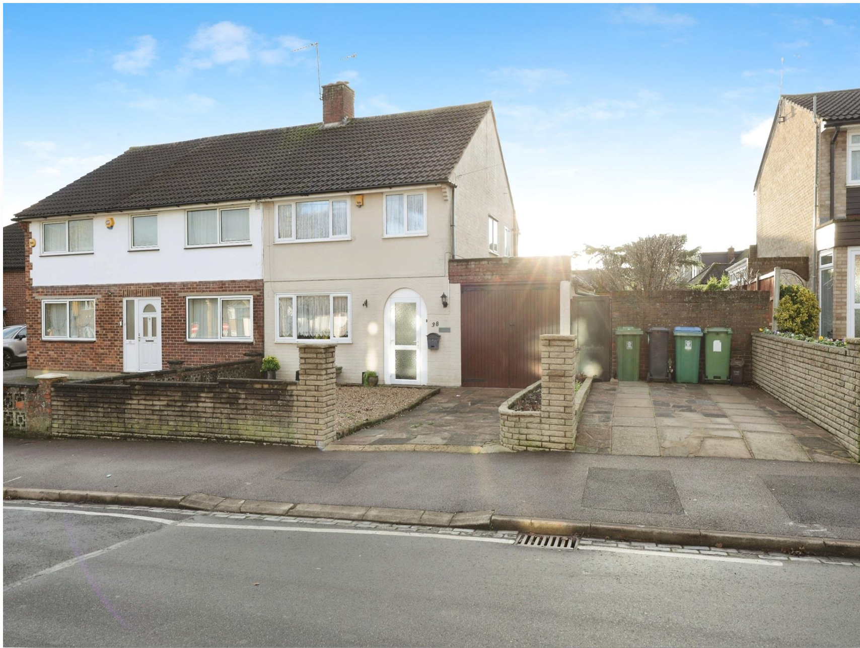
Douglas Avenue, Watford, WD24 7LT