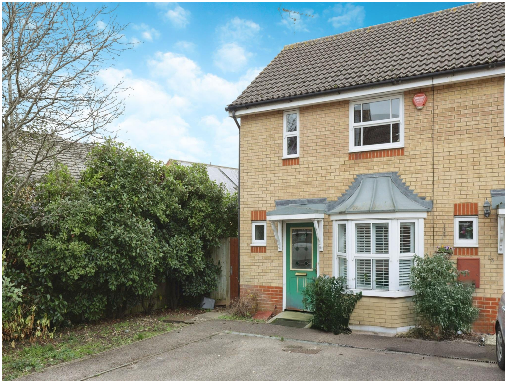
Merlin Way, Leavesden, Watford, WD25 7GJ