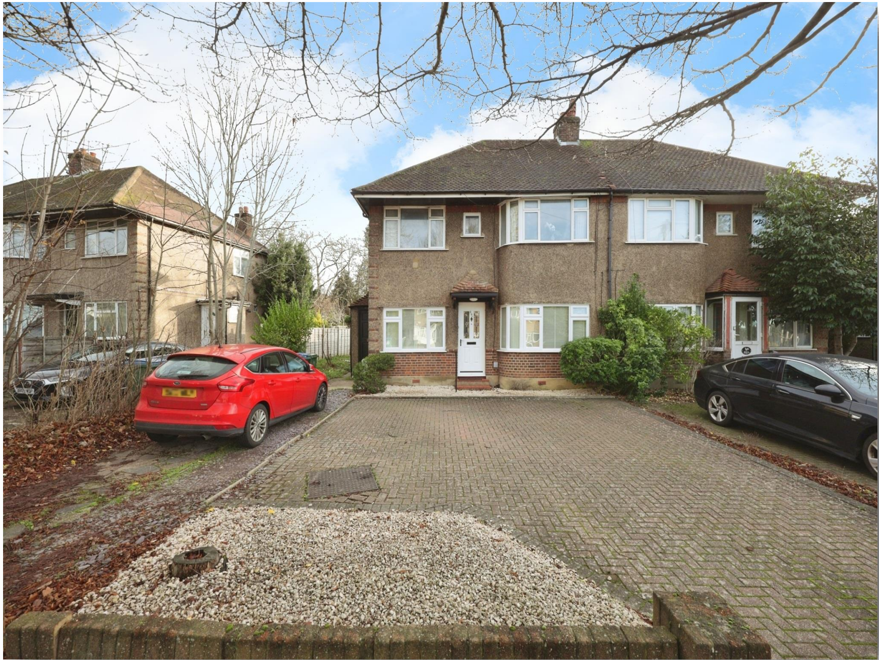
Courtlands Drive, Watford, WD17 4HT