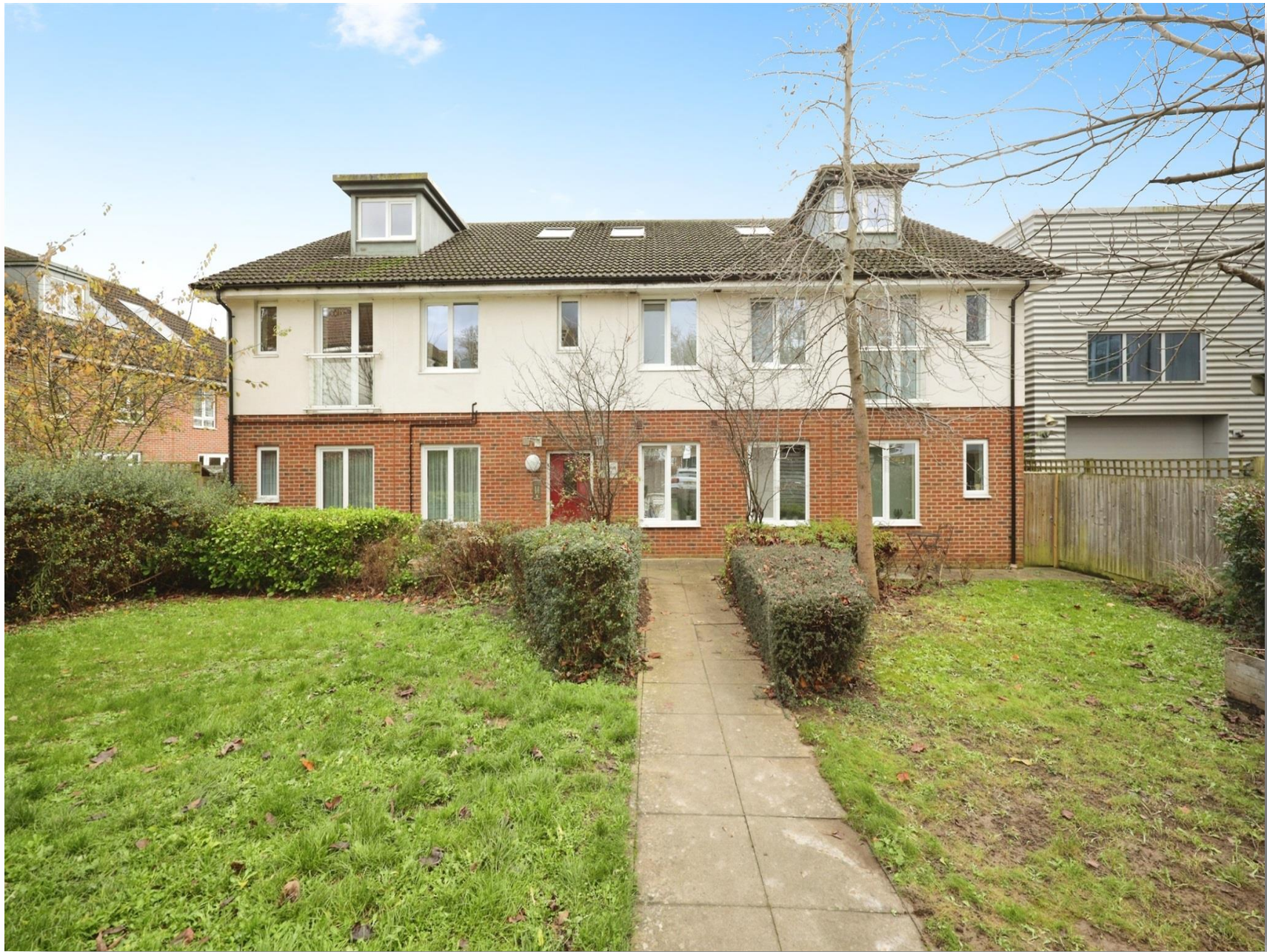
Royal Court, Queen Marys Avenue, Watford, WD18 7JN