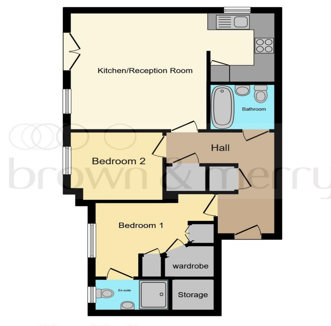
Total floor area 55.7 sq.m. (599 sq.ft.) approx

This floor plan is for illustrative purposes only. It is not drawn to scale. Any measurements, floor areas (including any total floor area), openings and orientation are approximate. No details are guaranteed, they cannot be relied upon for any purpose and they do not form part of any agreement. No liability is taken for any error, omission or misstatement. A party must rely upon its own inspection(s). Powered by www.focalagent.com