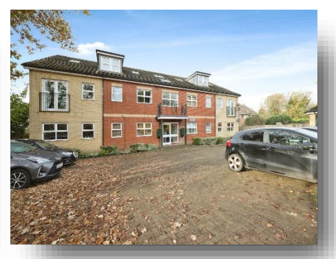
view this property online brownandmerry.co.uk/Property/WAF104328