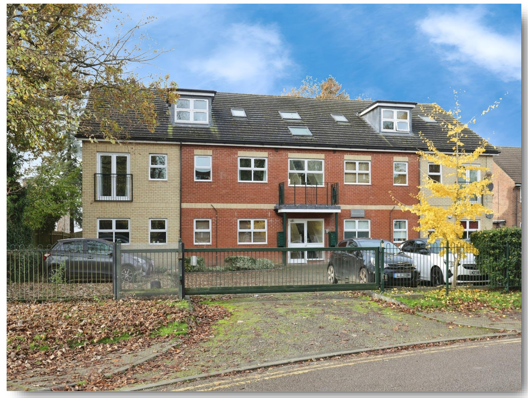
Woodview Court, Grandfield Avenue, Watford, WD17 4AN