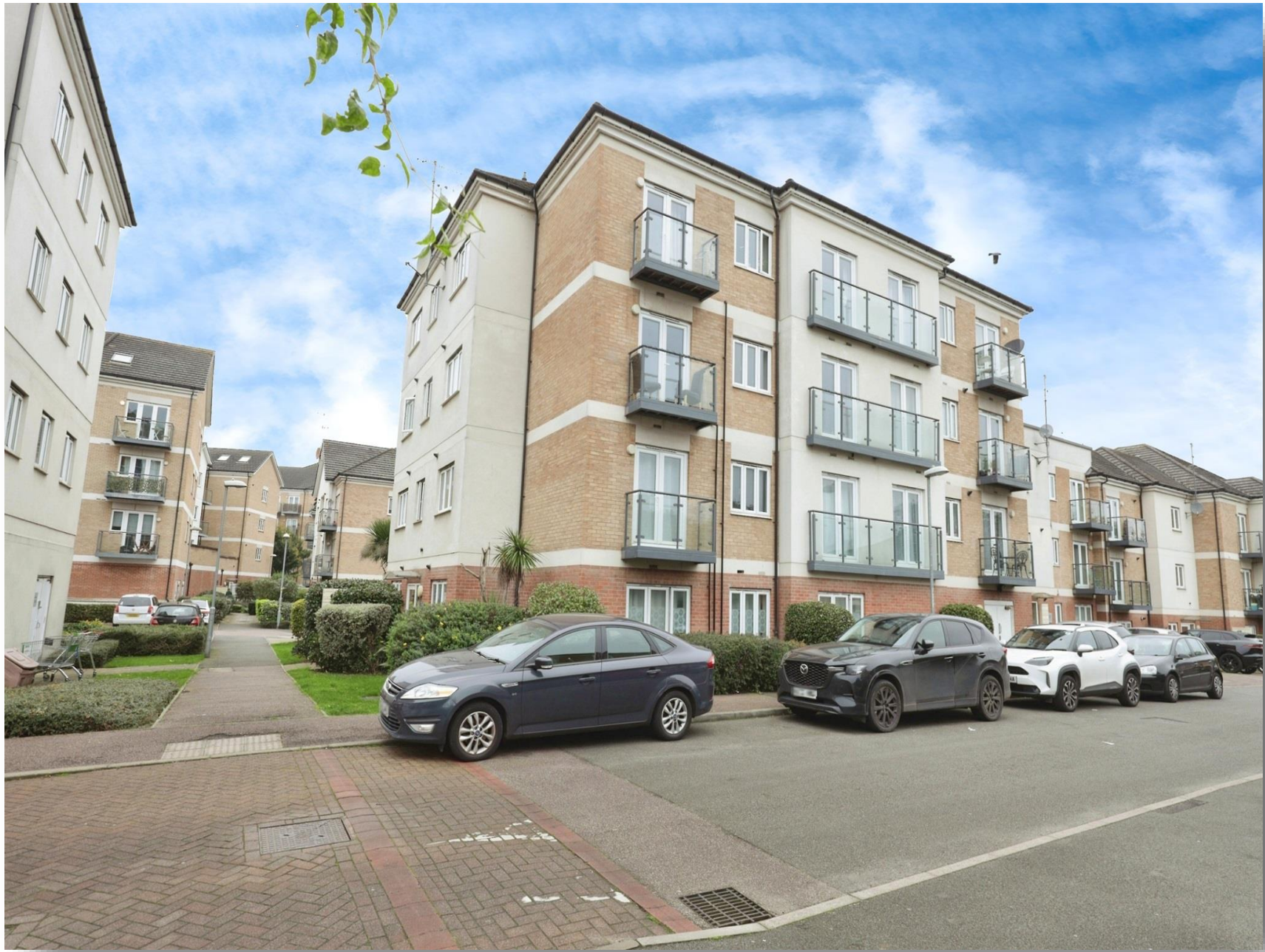
Da Vinci Court, Cezanne Road, Watford, WD25 9BF