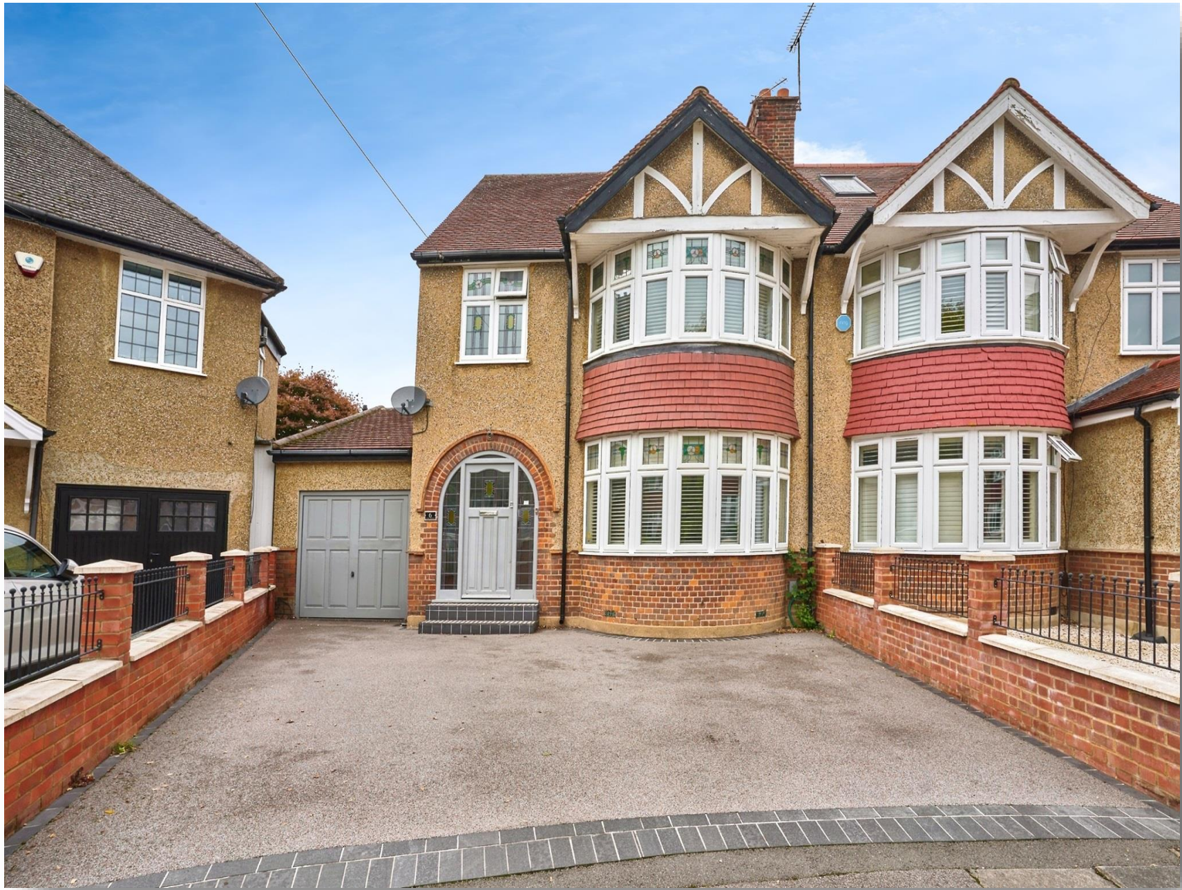
Swiss Close, Watford, WD18 7LW