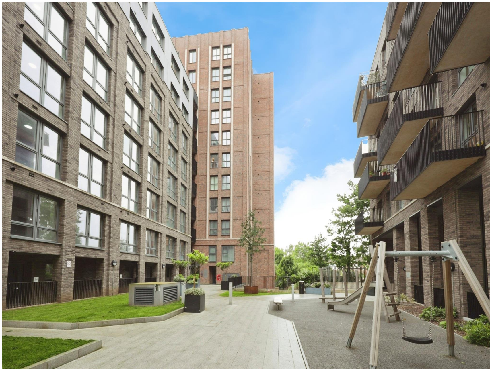
Conway Court, Marri Street, Watford, WD24 5GA