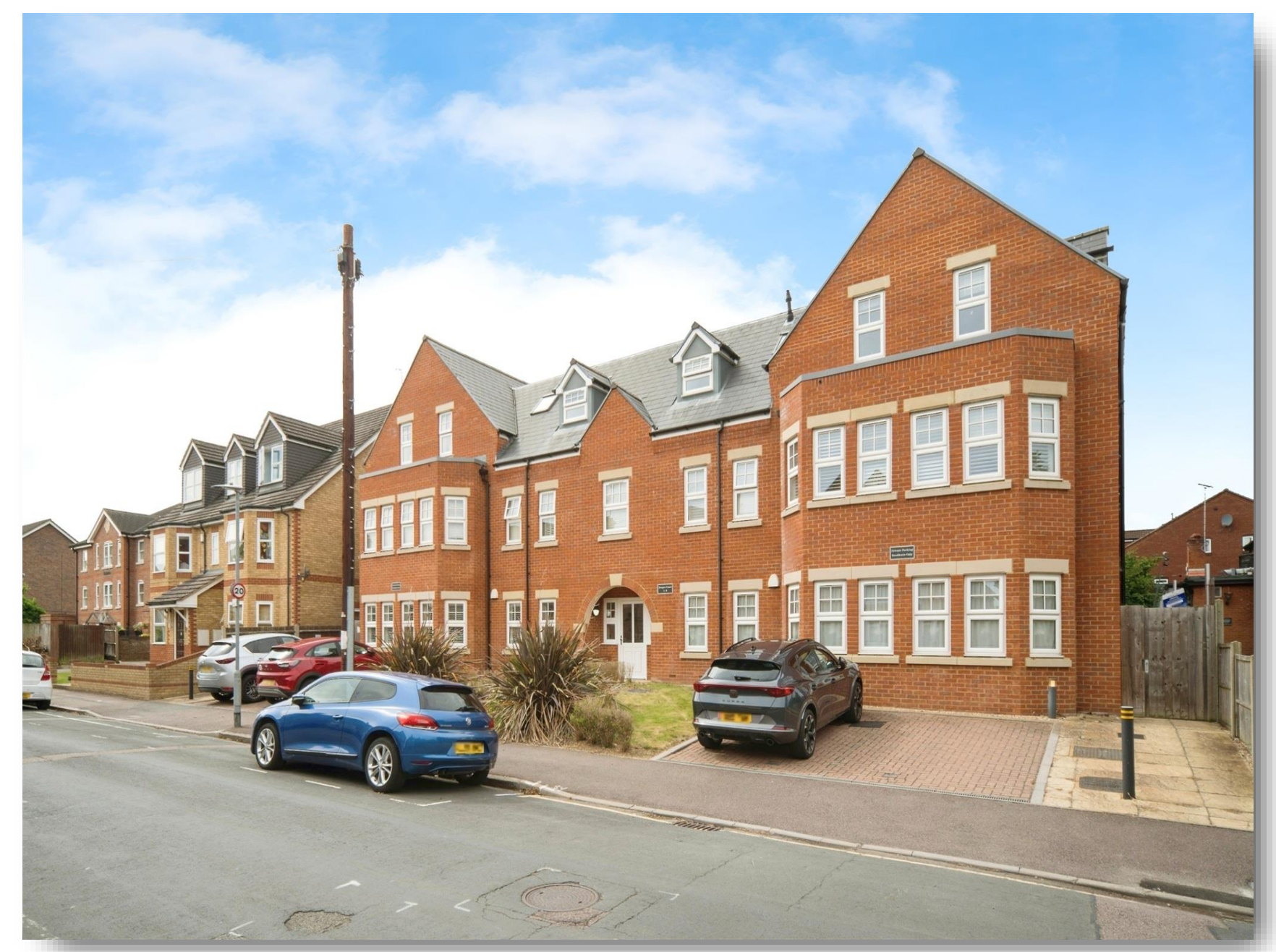
Rouper Court, Alexandra Road , Watford, WD17 4QY