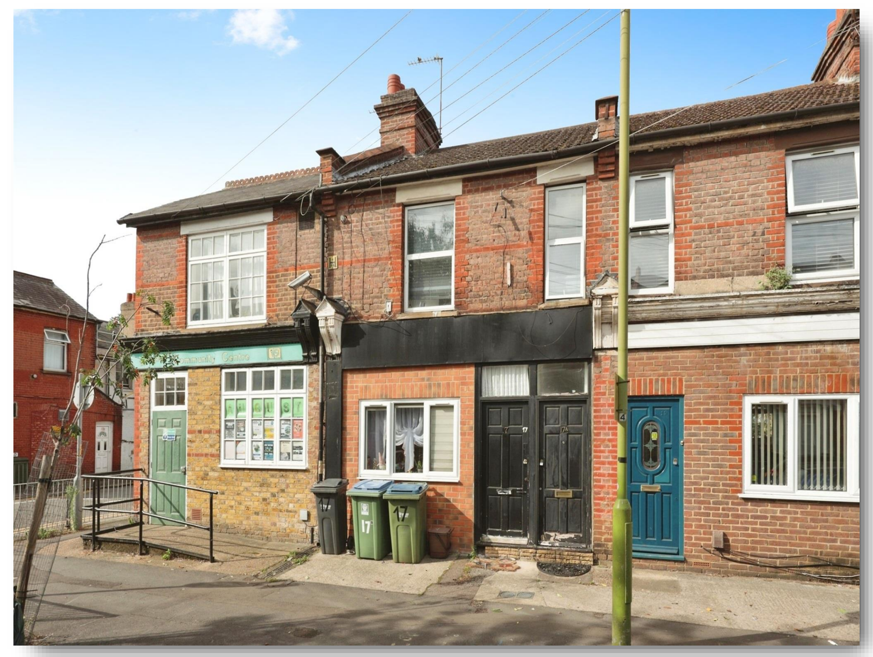
Harwoods Road, Watford, WD18 7RB