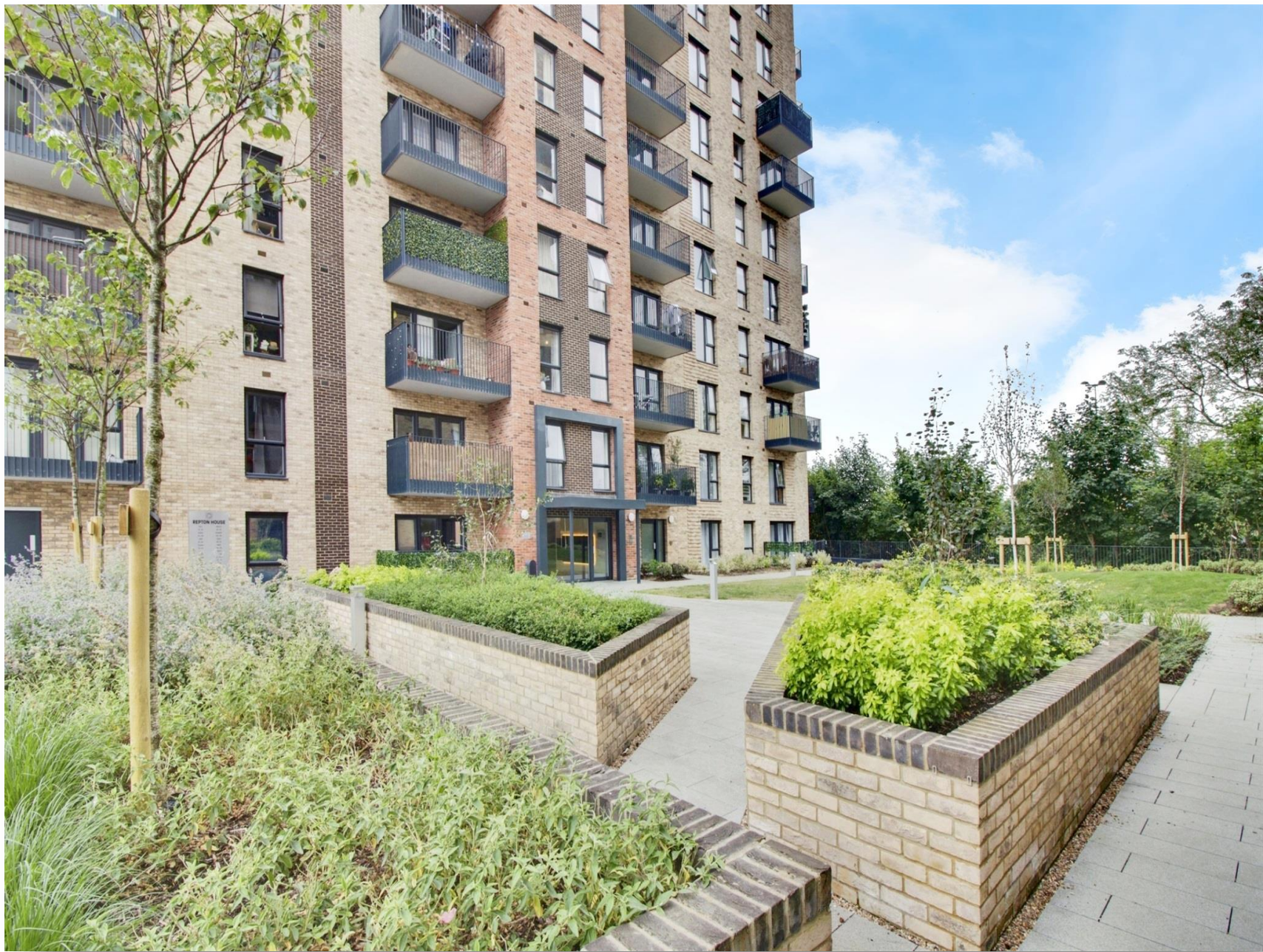
Repton House, Sydney Road, Watford, WD18 7ES