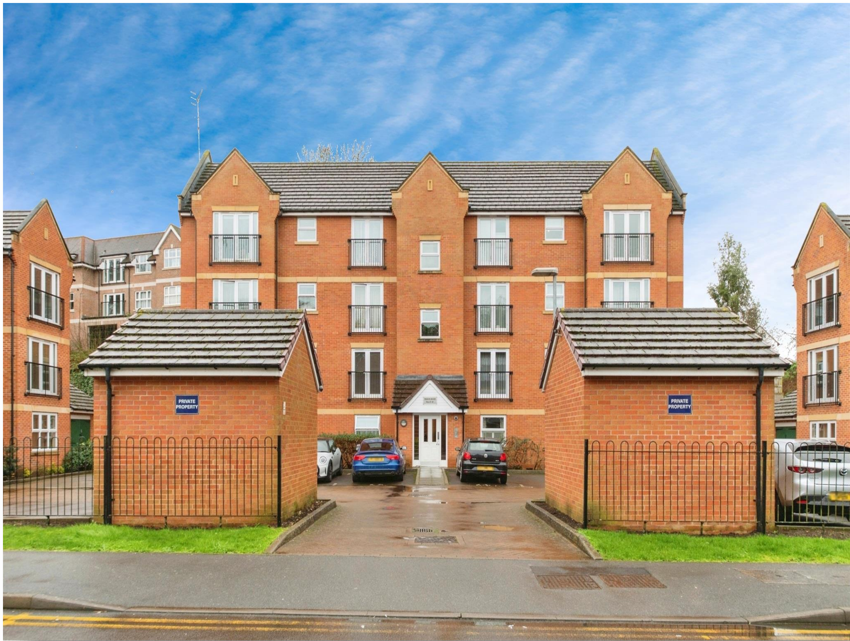
Walton Road, Bushey, WD23 2FE