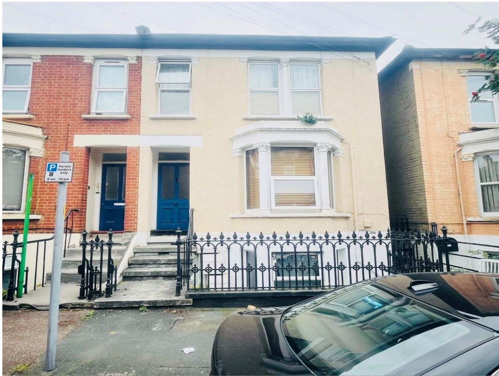
Gladstone Road, Watford, WD17 2RA