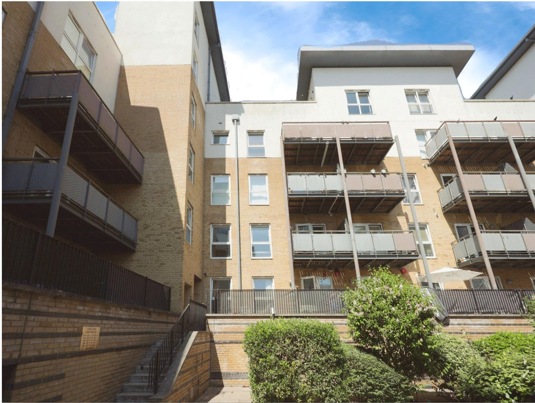
Catalonia Apartments Metropolitan Station Approach, Watford WD18 7BL