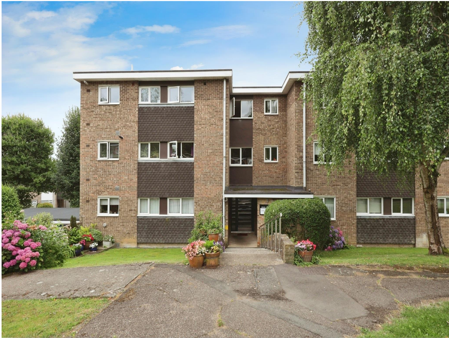
Prestwood, Upper Hitch, Watford WD19 5JB