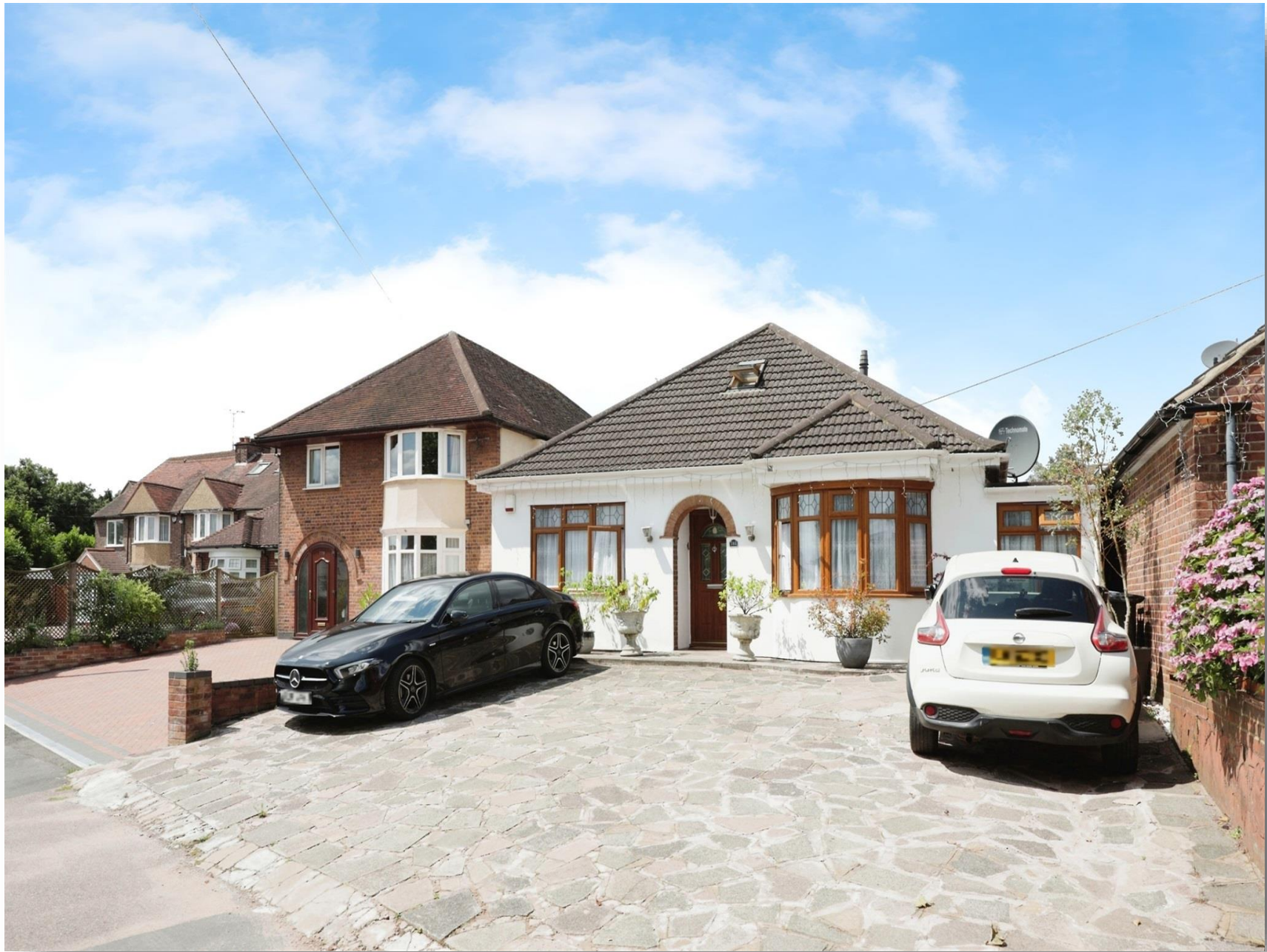
St. Albans Road, Watford, WD25 9LA