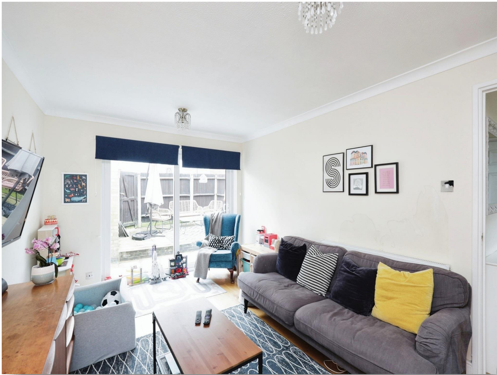
Throstle Place, Watford WD25 7SX