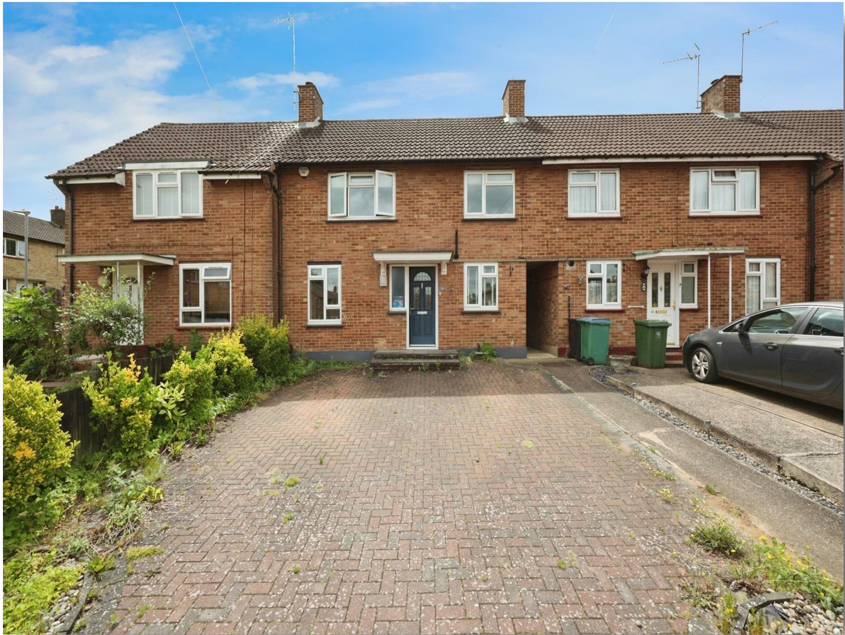
Queenswood Crescent, Watford, WD25 7DG