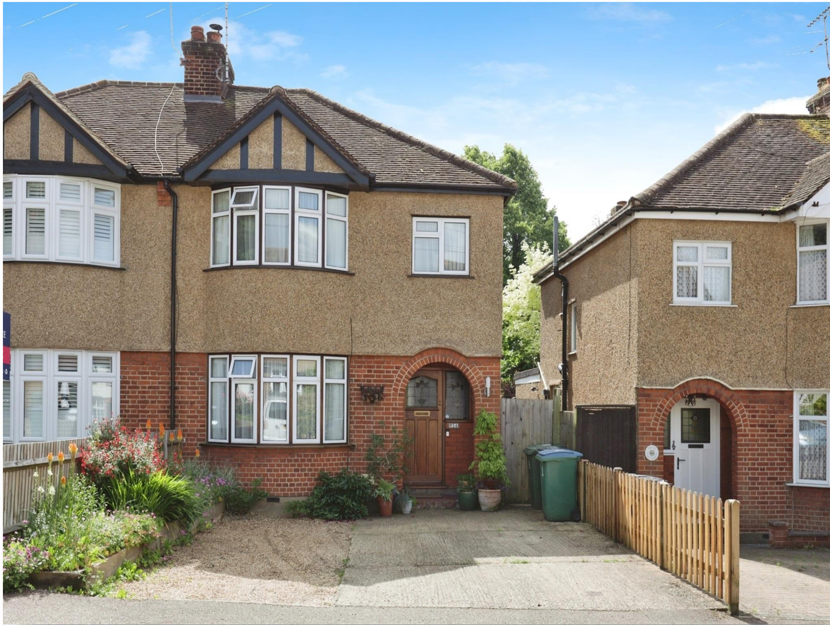
The Coppice, Watford WD19 4HR