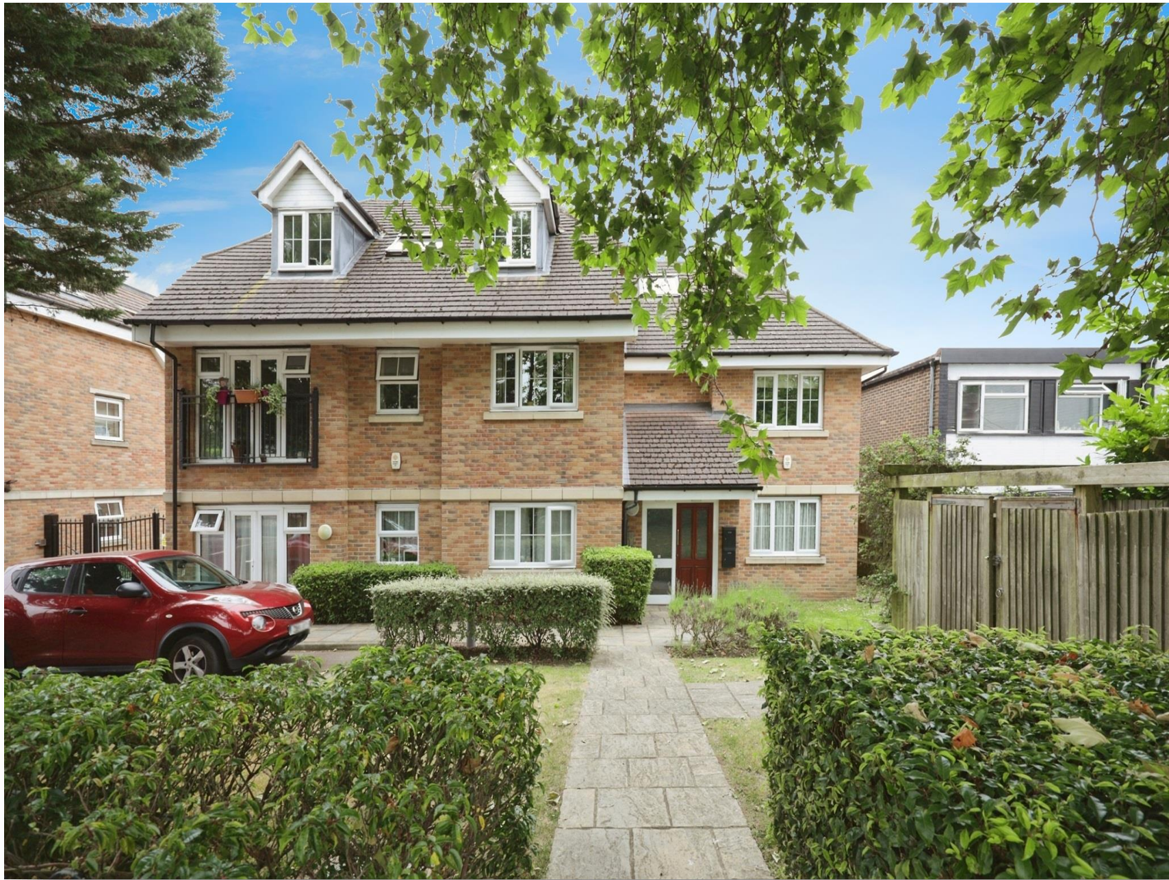
Arena, St. Albans Road, Watford, WD25 9FH