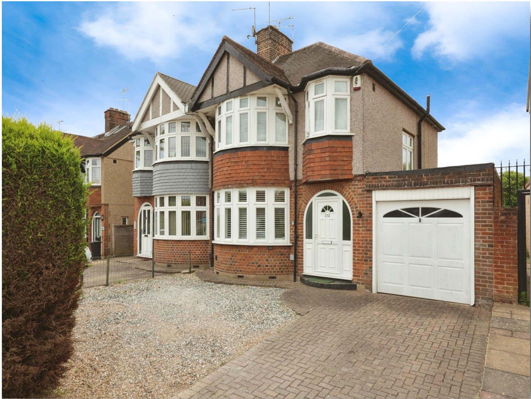
Bushey Mill Lane, Watford WD24 7PF